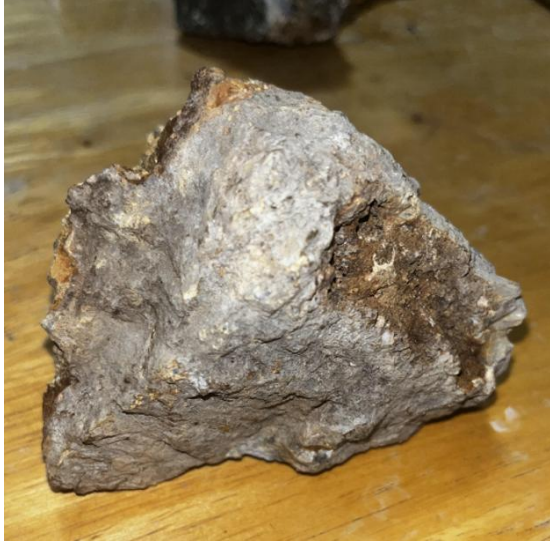
GR055 - 7.55 % Sb, 63.8 g/t Ag, 8.6% Zn Stewart Prospect