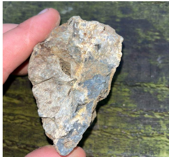
GR069 - 4.92% Sb - May Prospect

The results continue to support the potential for a district scale antimony, silver and polymetallic system at Gillham. The project covers approximately 5,000 acres across the Gillham East and West project areas and hosts more than 18 historical antimony and silver workings. Despite its historical production profile, the district has not previously been tested by modern drilling.