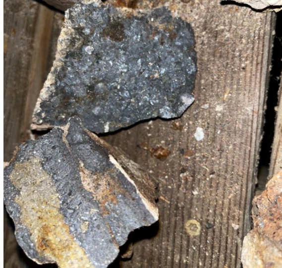
GR058 - 19.2% Sb, 12.25 g/t Ag, 1.1 % Pb Stewart North