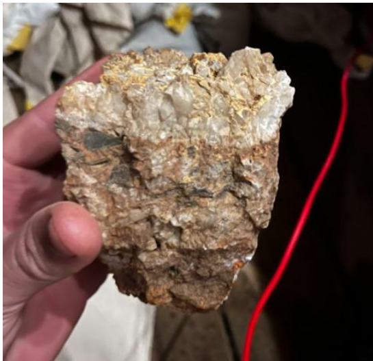
GR063 - 15% Sb - Antimony Bluff