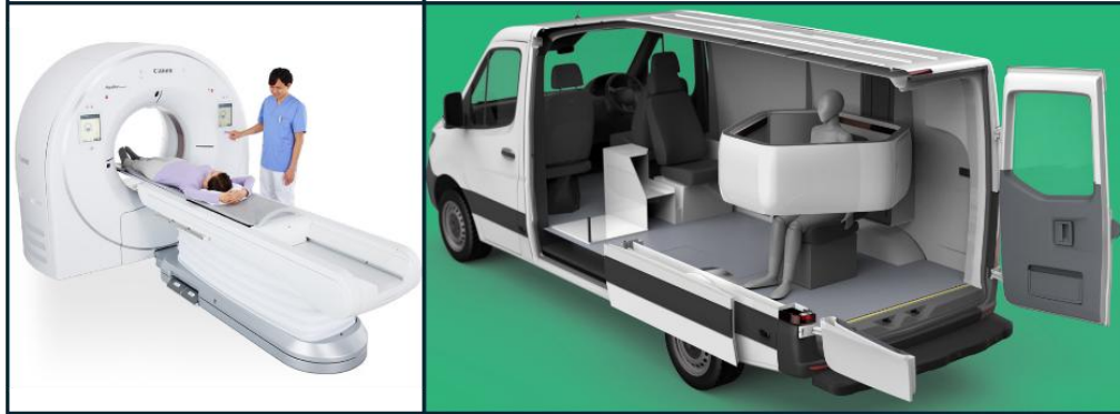
Figure 1: Comparison of conventional and possible deployable lung CT imaging systems.

Lung cancer is a significant public health challenge globally. It is the leading cause of cancer-related deaths worldwide, accounting for the highest mortality rates among both men and women. Several countries are implementing early screening programs for high-risk populations, including Australia. This project's funding supports the investigation of enabling technologies that may contribute to future deployable imaging solutions addressing this global clinical need.