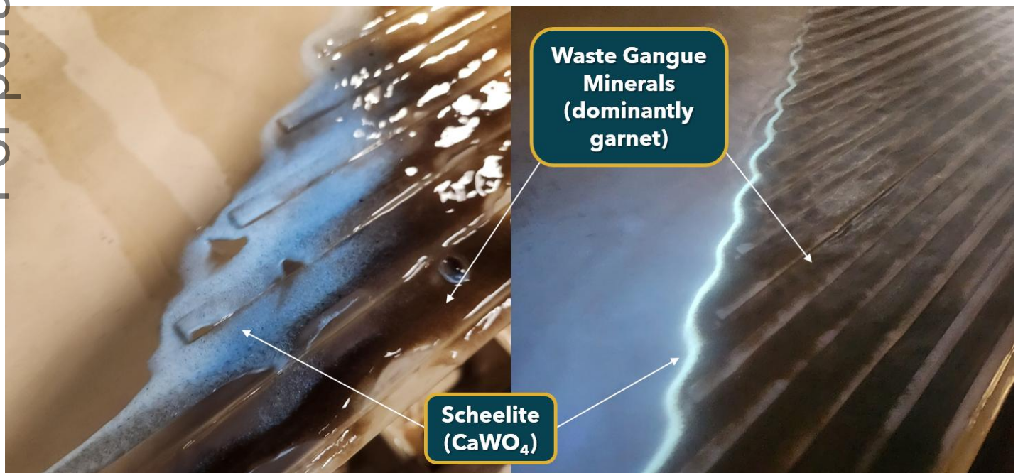
Figure 1; Photo showing separation of scheelite (white) from waste minerals (dark brown) during Wilfley table gravity concentration stage. Wilfley concentrate feeds into the Mozley table cleaning stage. Assayed grade of Mozley table concentrate is 66.6% WO 3 .