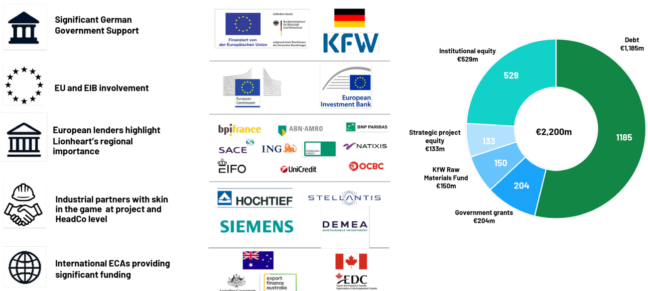
Figure 2: Image showing the combination of arrangements comprising the financing package at the project, subsidiary and head Company level.