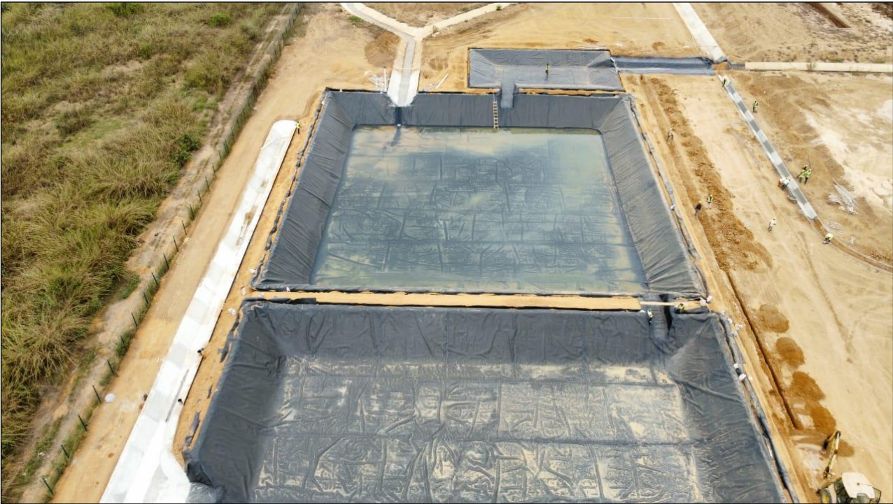
Figure 4 - Cabinda Phosphate Fertilizer Project, water run-off settling ponds.