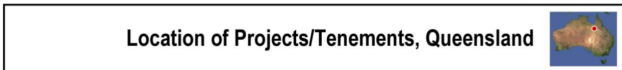
Figure 2: Location of Burke/Mt Dromedary and Corella Graphite Projects and Leichhardt Crossing Tenement in Queensland

The Graphite Projects have access to well-developed transport infrastructure, including airports at Cloncurry and Mount Isa (located ~250km by road from Burke/Mt Dromedary) and a Port in Townsville (located ~783km by road or rail from Cloncurry) (refer to Figure 2).