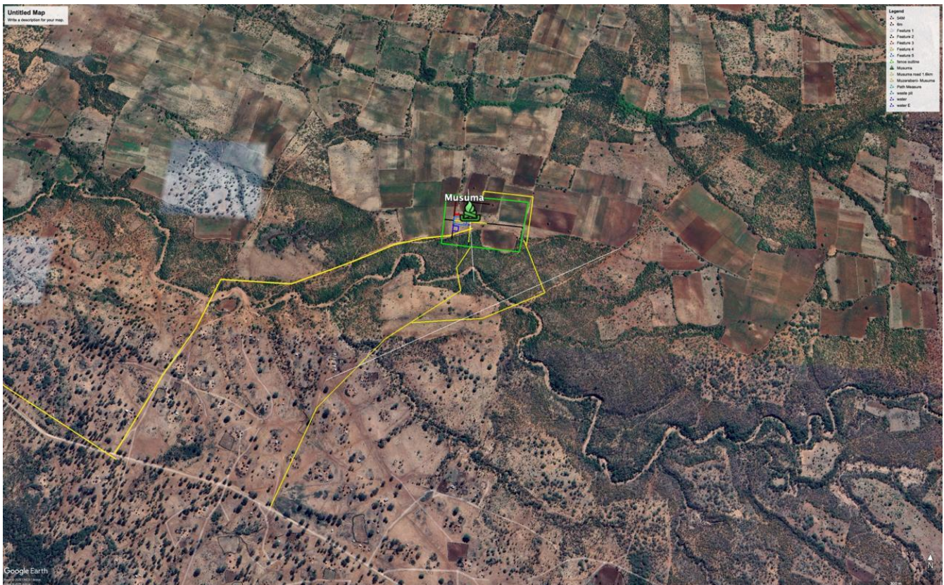
Figure 2: Proposed Musuma-1 wellpad location