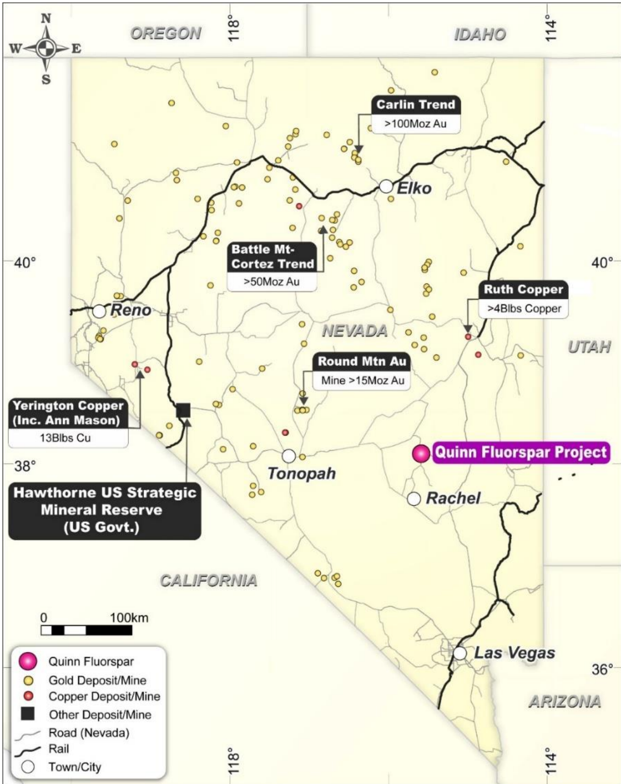
Figure 3 Quinn Fluorspar Location in Nevada.