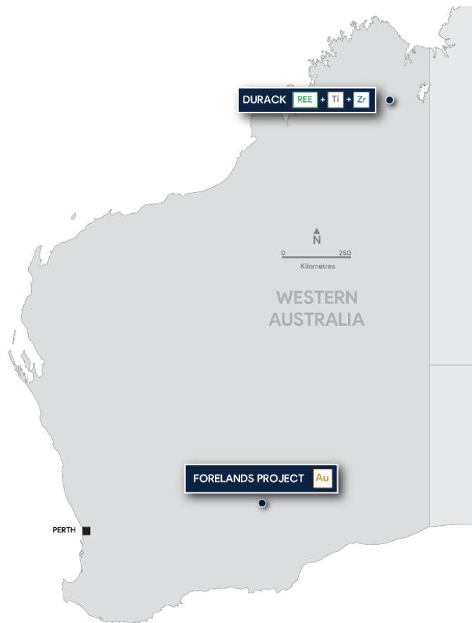
BPM Minerals Western Australian Projects

BPM Minerals Limited (ASX:BPM) is a Perth-based precious and critical mineral explorer with a portfolio of projects located across Western Australia. The Company seeks to build its landholdings within Tier-1 mining jurisdictions. The company is currently focussed upon its newly acquired Forelands Project, an underexplored, high-grade gold system situated along a major structural corridor on the Yilgarn-Albany Fraser margin. The management and exploration teams are well supported by an experienced Board of Directors who have a strong record of funding and undertaking exploration activities which have resulted in the discovery of globally significant deposits both locally and internationally.