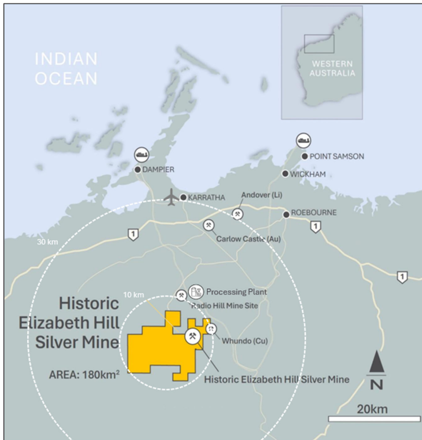
Figure 3: Tenement Location

Through the consolidation of surrounding land packages into a single contiguous 180km 2 package, significant exploration and growth potential has been created near mine and regionally. The land package holds a significant portion of the Munni Munni Fault system and other fault systems subparallel to the Munni Munni Fault system, which are considered prospective for Elizabeth Hill silver deposit analogues.