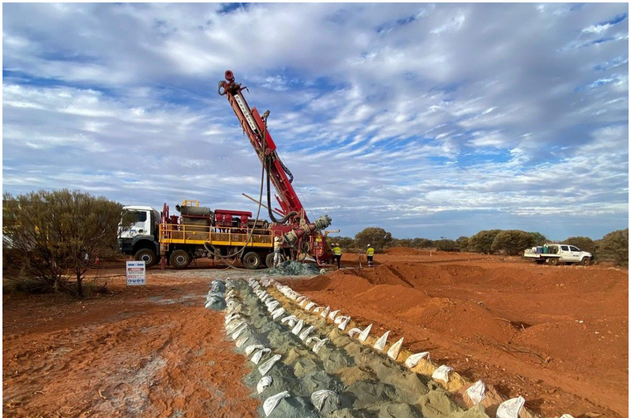
Figure 1: Westdrill Pty Ltd rig at the Ned's creek Gold project, WA

Lodestar Minerals Limited ("LSR" or "the Company") (ASX: LSR) is pleased to announce the commencement of a reverse circulation (RC) 10,000m drilling program at its 100% owned Ned's Creek Project in Western Australia, marking a major step towards delivering a maiden Mineral Resource Estimate in 2026.