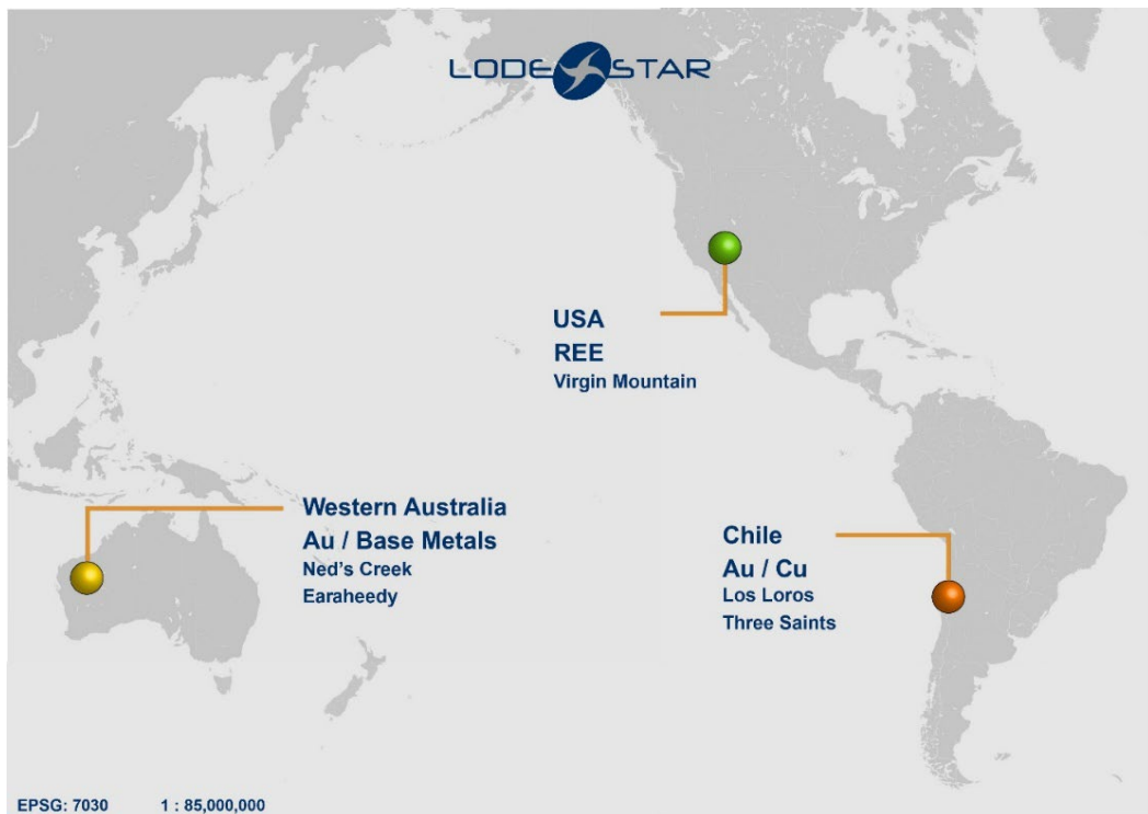
Figure 4: Global map of Lodestar Projects

Lodestar also has exposure to lithium via its 27.5M performance rights in ORE Resources ( ASX:OR3 ) (previously known as Future Battery Minerals, ASX: FBM) who own the Kangaroo Hills and Miriam Projects in Western Australia.