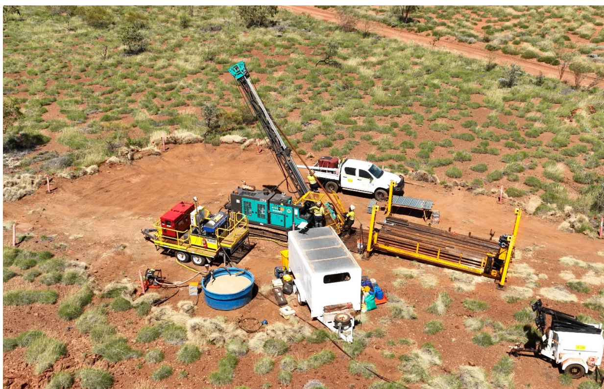
Photo: Diamond drill rig currently at Elizabeth Hill. Drilling in progress.

Focus through the next three months of exploration activities will be on processing, interpreting and reporting results, as well as dynamic repositioning of remaining planned drill holes to maximise chances of success from results received (geological, geophysical and assay results).