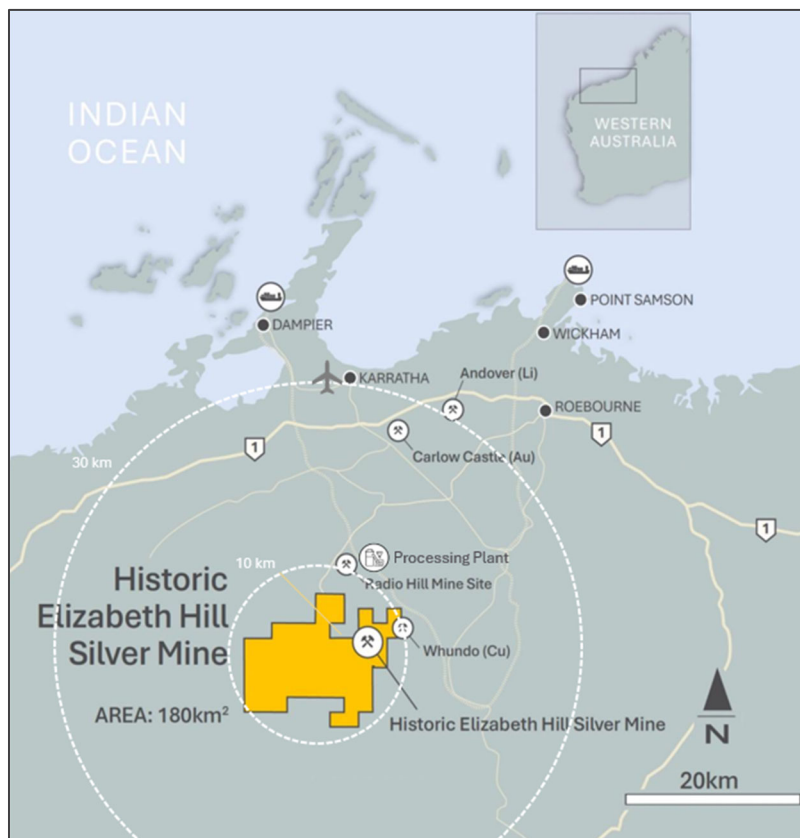
Figure 3: West Coast Silver (WCE) project tenement location

Through the consolidation of surrounding land packages into a single contiguous 180km 2 package, significant exploration and growth potential has been created near mine and regionally. The land package holds a significant portion of the Munni Munni Fault system, and other fault systems subparallel to the Munni Munni Fault system, which are considered prospective for Elizabeth Hill silver deposit analogues.