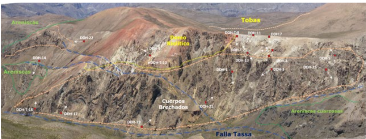
Figure 1: Drill hole collar locations on the Tassa Project Area.