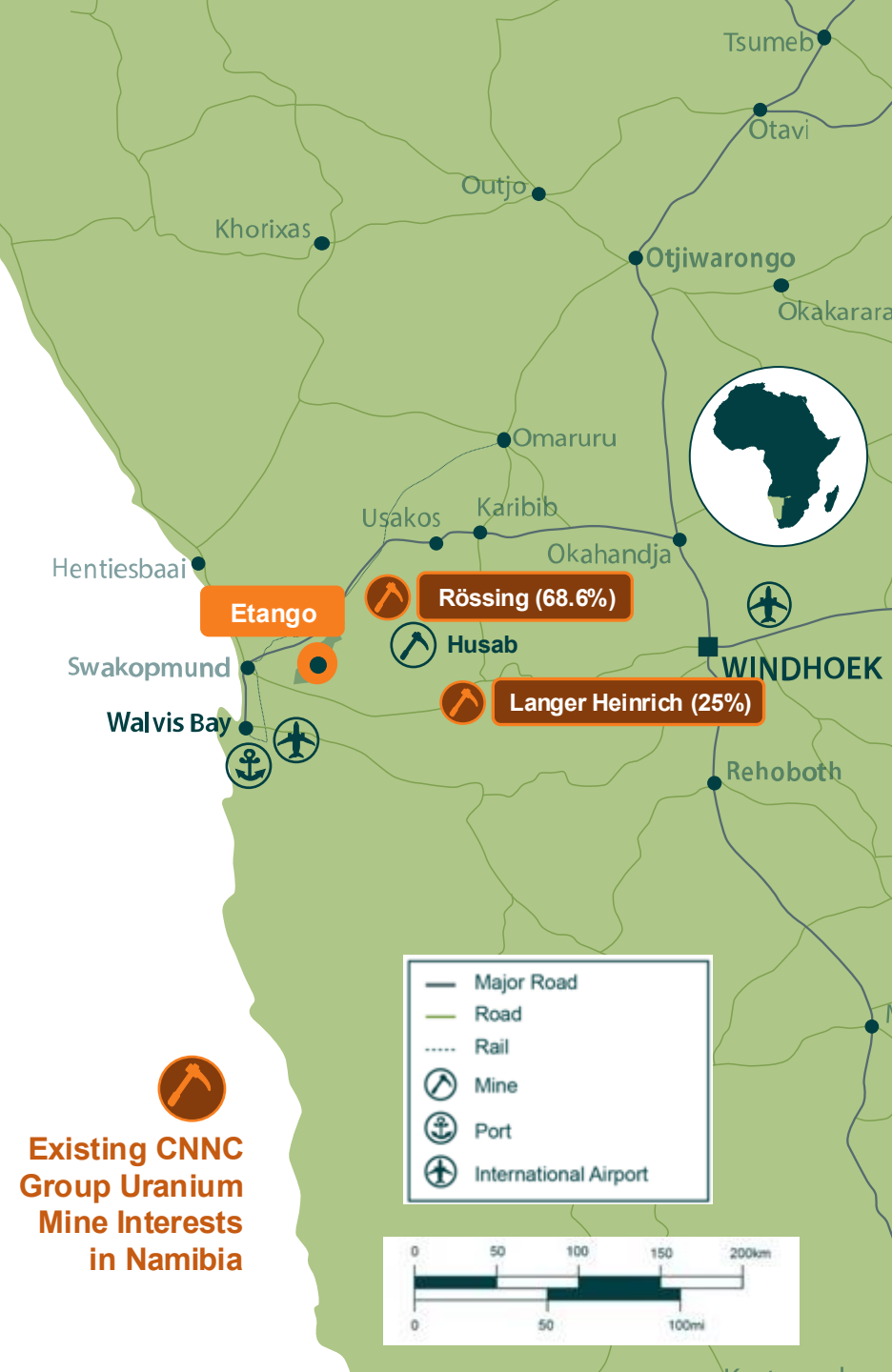
Existing CNNC Group Uranium Mine Interests in Namibia