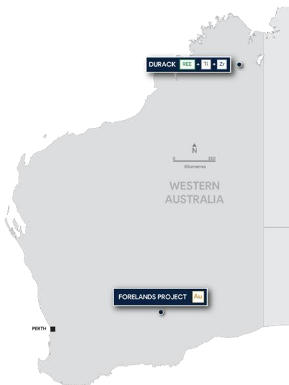
BPM Minerals Western Australian Projects

BPM Minerals Limited (ASX:BPM) is a Perth-based precious and critical mineral explorer with a portfolio of projects located across Western Australia. The Company seeks to build its landholdings within Tier-1 mining jurisdictions. The company is currently focussed upon its newly acquired Forelands Project, an underexplored, high-grade gold system situated along a major structural corridor on the Yilgarn-Albany Fraser margin. The management and exploration teams are well supported by an experienced Board of Directors who have a strong record of funding and undertaking exploration activities which have resulted in the discovery of globally significant deposits both locally and internationally.