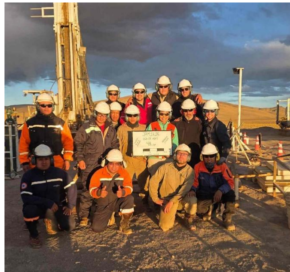
Figure 1. Core extracted at 479m show highly porous sandy sediment soaked in brine – RHS drill team