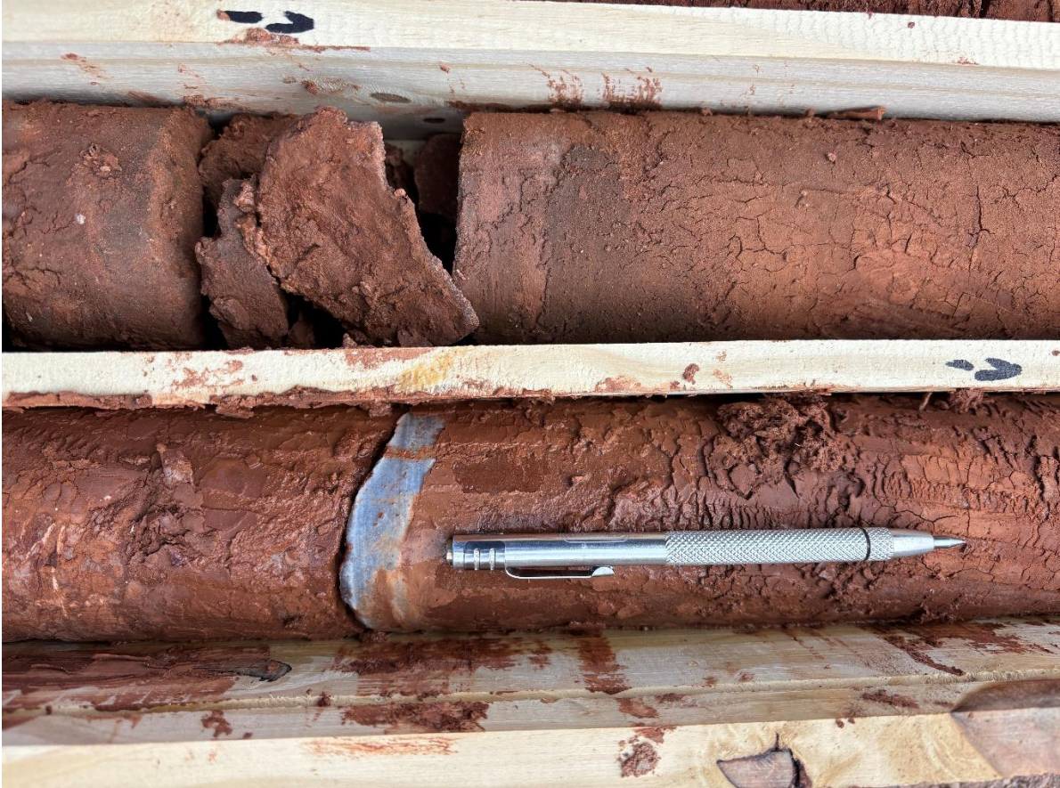
Figure 2. The claystone unit showing a large anhydrite secondary filling in the fracture. The unit is entirely non-porous clay.

Phillip Thomas, Executive Chairman commented "Well JAM 26-06 has been a great success with over 180m of highly porous sediments and the specific gravity reaching 1.13\text{gm}/\text{cm}^3 . The results of this well and 25-05 provide a good correlation with well 24-02 and can extend the aquifer domains with confidence. When the assays are received, the Company will have a strong story to tell. Our next task is to choose a well site which will further increase our Mineral Resource to indicated status."