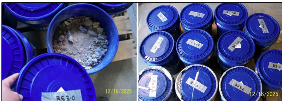
Figure 2: Batch samples collected from historical underground development at DAM.