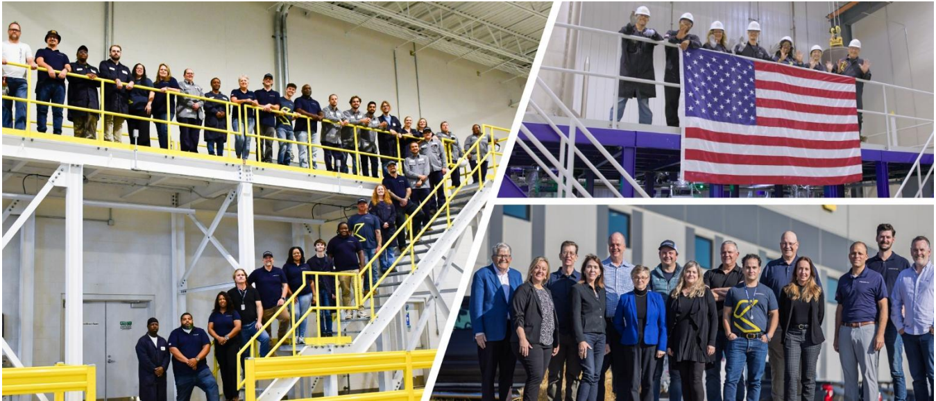
IperionX Virginia operations & leadership teams

In 2026 we will reach key commercial-scale validation milestones and share performance data, establishing the basis for sustained, capital-efficient scaling through 2030 and beyond, positioning IperionX as the leading producer of low-cost, American-made titanium.