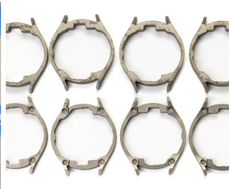
IperionX titanium components