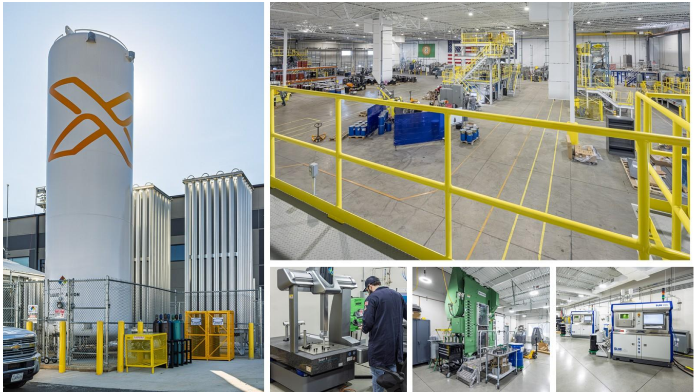
IperionX's Virginia Titanium Campus

Our strategy is clear and ambitious: a fully integrated, sovereign platform that converts low-cost domestic scrap and minerals into the highest-performance products. By eliminating waste, shortening lead times, and driving costs steadily lower, we are redefining the economics of titanium and reclaiming American leadership in a metal vital to national security.