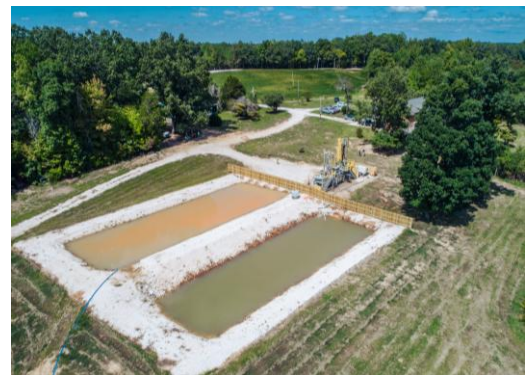
IperionX's Titan Critical Mineral Project, Tennessee