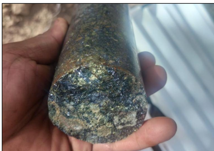
Figure 1. Photograph of exceptionally high grade silver and gold-bearing sulphide mineralisation in new Yoquivo drill hole YQ-25-009 at 322.7m down hole. This sample returned 0.67 metres at 5,739g/t AgEq 1 (2,780g/t Ag & 38.6g/t Au) from 322.58m.