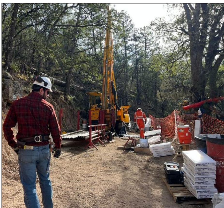
Figure 2. Photograph of the diamond rig set up and drilling hole YQ-25-009 in the central portion of Pertenencia at Yoquivo.

YQ-25-009 0.3m at 1,120g/t AgEq - 790g/t Ag & 4.3g/t Au from 115.8m 2.43m at 203g/t AgEq - 159g/t Ag & 0.6g/t Au from 129.82m incl. 1.03m at 366g/t AgEq – 287g/t Ag & 1.0g/t Au from 129.82m 2.05m at 512g/t AgEq - 325g/t Ag & 1.0g/t Au from 138m 14.1m at 320g/t AgEq - 167g/t Ag & 2.0g/t Au from 309.9m incl. 1.5m at 2,663g/t AgEq – 1,331g/t Ag & 17.4g/t Au from 321.75m 1.2m at 385g/t AgEq - 267g/t Ag & 1.5g/t Au from 377.6m