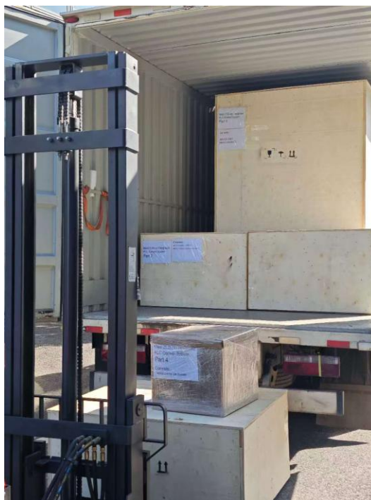
Images: Sprintex PLC Control Systems under production and readied for shipment (December 2025)