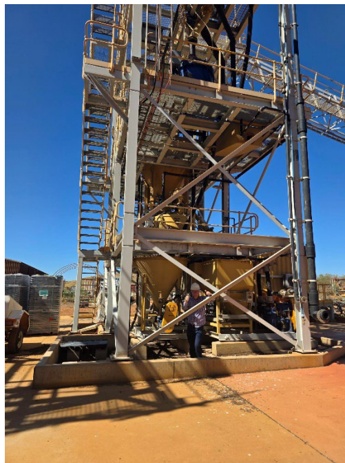
Figure 2 – Radio Hill Gekko Plant (2025)