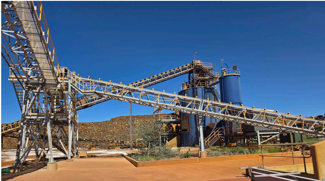
Figure 1 – Radio Hill Processing Plant (2025)

The Radio Hill Processing Plant is a fully permitted 425,000 tonnes per annum (tpa) nickel–copper concentrator located 35 km south of Karratha in Western Australia’s Pilbara region. Artemis purchased the plant in 2016 and surrounding assets from Fox Resources. The plant includes flotation circuits, tailings storage facility, administration and maintenance buildings, fully developed underground mine and Gekko gravity plant. The plant remains on care and maintenance but can be rapidly recommissioned.