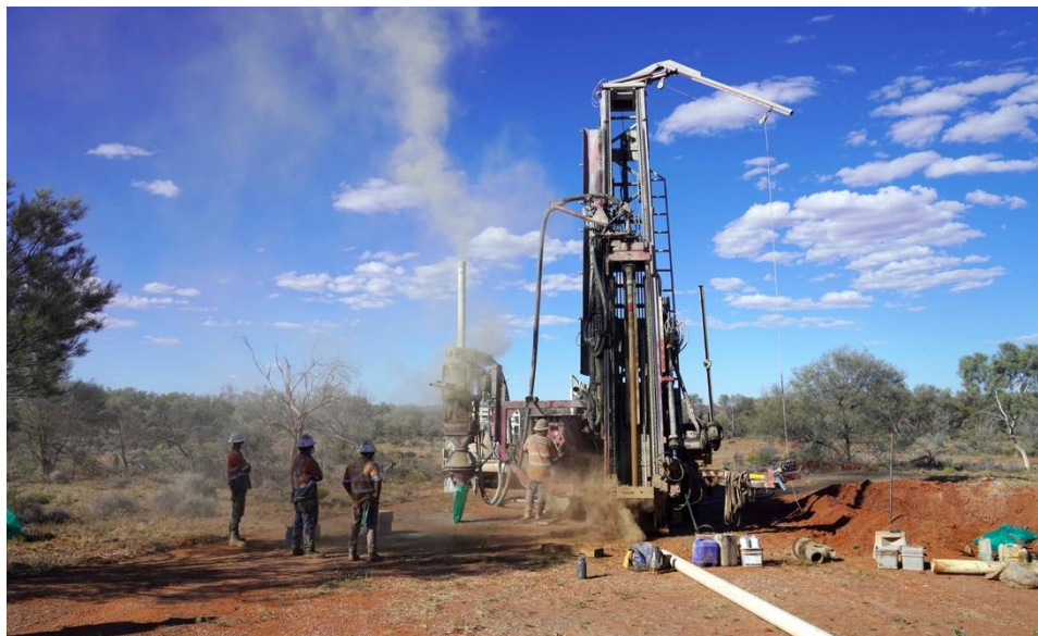
Figure 1. Drill rig at the Falchion Prospect, Reynolds Range

"iTech is excited to have completed a successful drilling campaign at the Reynolds Range Gold-Antimony Project. The program drill tested beneath high grade, outcropping antimony and gold mineralisation at the Sabre, Falchion and Lander Prospects and beneath high grade gold rock chips at the Pine Hill Gold Prospect. The Company is eagerly anticipating the results of drill assays which are expected in coming weeks"