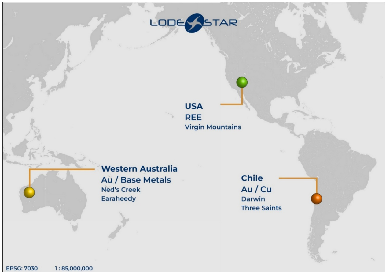
Figure 4: Global map of Lodestar Projects

Lodestar Minerals is an active critical metals, gold and base metals explorer. Lodestar’s projects include the Virgin Mountain REE project in USA, the Darwin and Three Saints Copper & Gold projects in Chile and the 100% owned Earahedy and Ned’s Creek Gold projects in Western Australia (Figure 4).