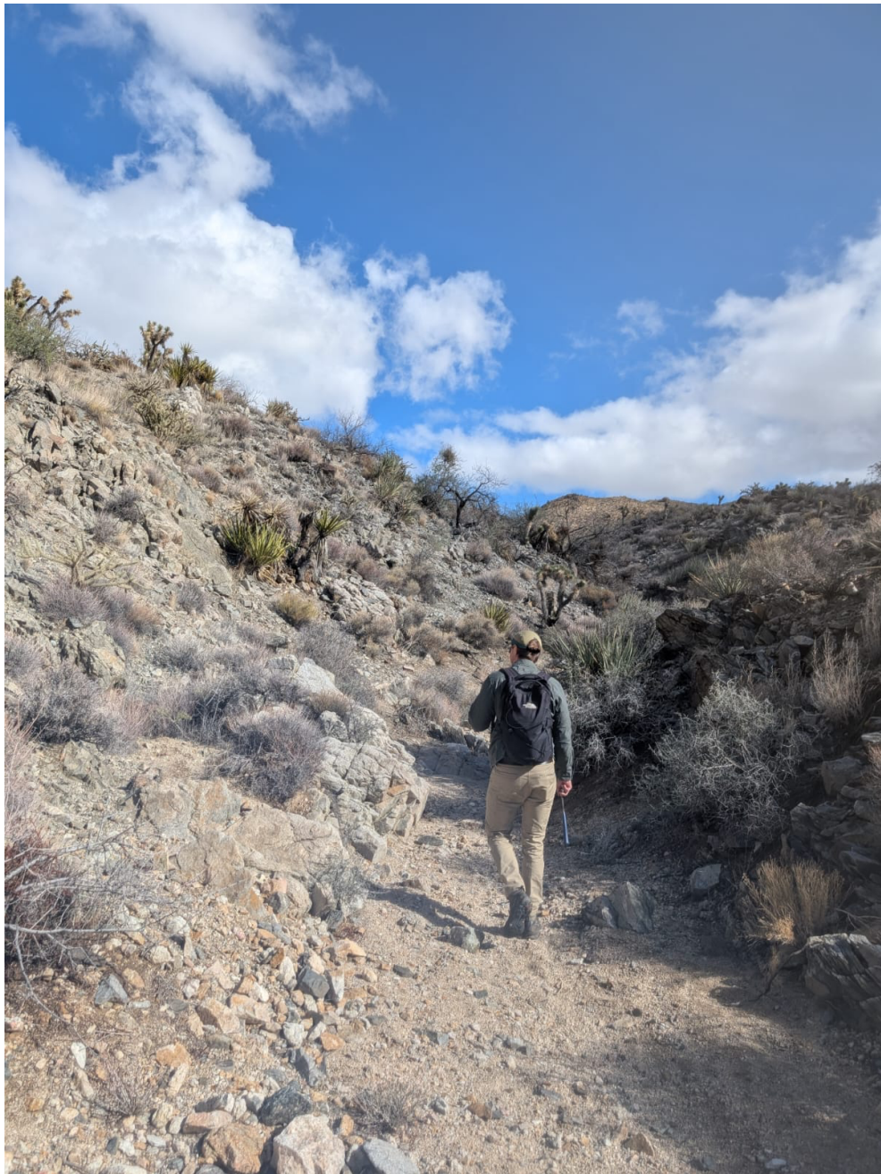
Figure 2: Lodestar consultant geologist on the ground

The historic heavy rare earth element suite reported includes yttrium, ytterbium, dysprosium, terbium, gadolinium, holmium, erbium, lutetium and thulium , alongside key light rare earth magnet elements neodymium and praseodymium .