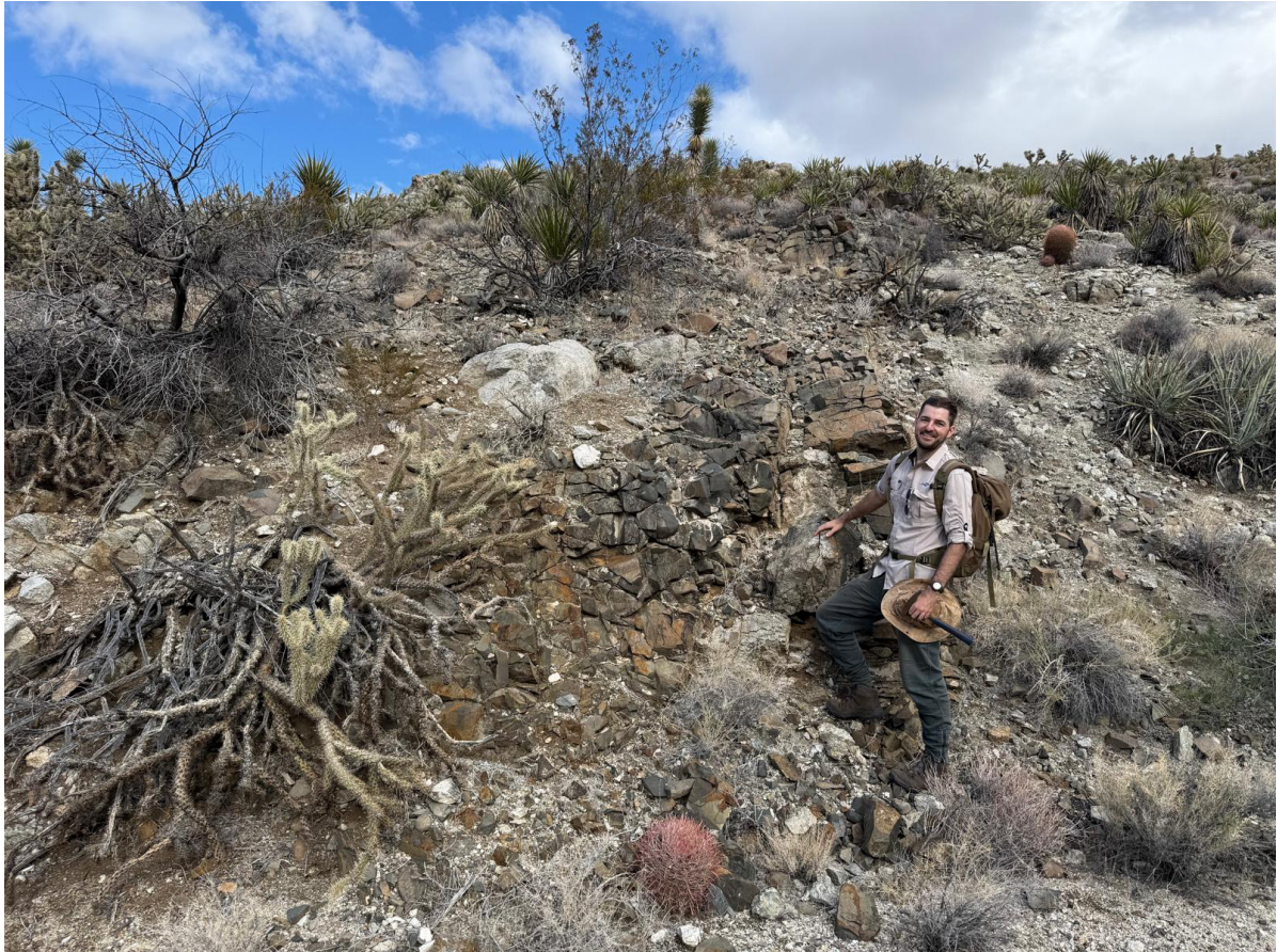
Figure 1: Lodestar lead consultant geologist on the ground

The maiden program marks Lodestar’s first on-ground exploration work since Lodestar entered into an option agreement on the Virgin Mountain project in September 2025.