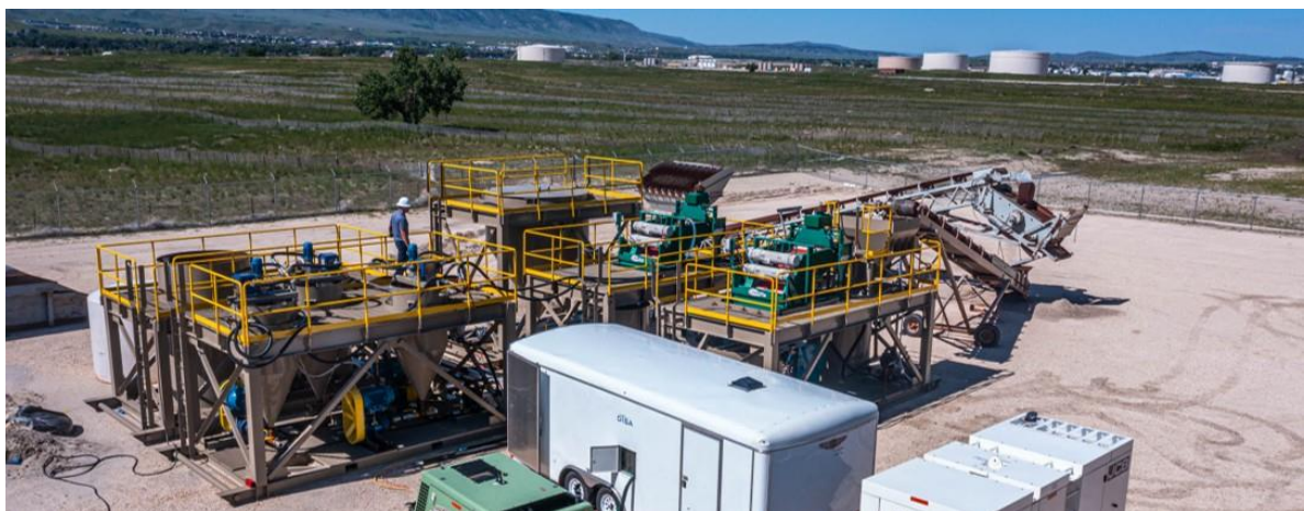
Figure 1. Gen 8 modular HPSA components

Mandrake Resources Limited (ASX: MAN) (Mandrake or the Company) is pleased to announce the signing of a non-binding Term Sheet with DISA Technologies Inc. (DISA) to evaluate the potential use of DISA's patented High Pressure Slurry Ablation (HPSA) technology to treat and recover uranium and other critical minerals from abandoned mine waste (AMW) material located within Mandrake's 100%-owned 93,755 acre (approximately 379 km 2 ) Utah Project.