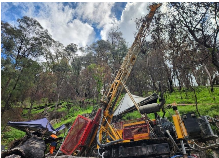
Figure 1. Diamond rig drilling down-plunge targets on site at Happy Valley, November 2025.

*In relation to the disclosure of visible mineralisation, the Company cautions that visual estimates of mineral abundance should never be considered a proxy or substitute for laboratory analysis. Laboratory assay results are required to determine actual widths and grade of the visible mineralisation reported in preliminary geological logging. The Company will update the market when laboratory analytical results become available for these holes, expected to be in late November/Early December 2025.