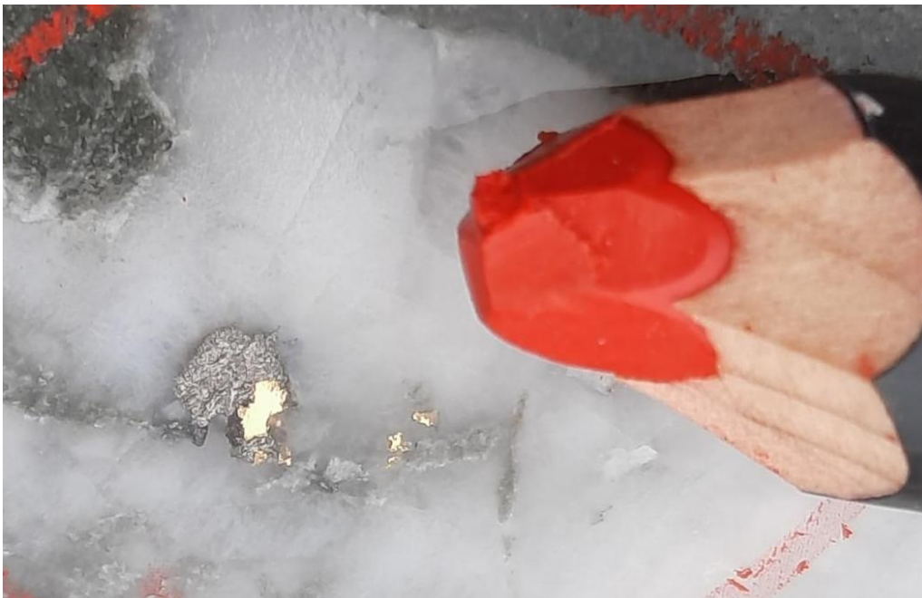
Figure 2. Visible gold grains (lustrous yellow) up to 2mm associated with sulphides (grey) in quartz from AMD014A at 465.0m 1 . Assays are currently pending for this hole. Note: In relation to the disclosure of visible mineralisation, the Company cautions that visual estimates of mineral abundance should never be considered a proxy or substitute for laboratory analysis. Laboratory assay results are required to determine actual widths and grade of the visible mineralisation reported in preliminary geological logging.

The decision to mobilise a second rig to Happy Valley follow a recent intersection with visible gold 1 in hole AMD014A ( Figures 2 & 3 ) for which assay results are currently pending (see ASX AVM 29 October 2025 for full details). The encouraging mineralisation in hole AMD014A represented a very substantial step-down from the previous deepest intersection, extending mineralisation at depth by at least 140 metres ( Figure 3 ) and defining a potentially contiguous, high grade gold zone extending from the surface to more than 500 metres down-plunge.