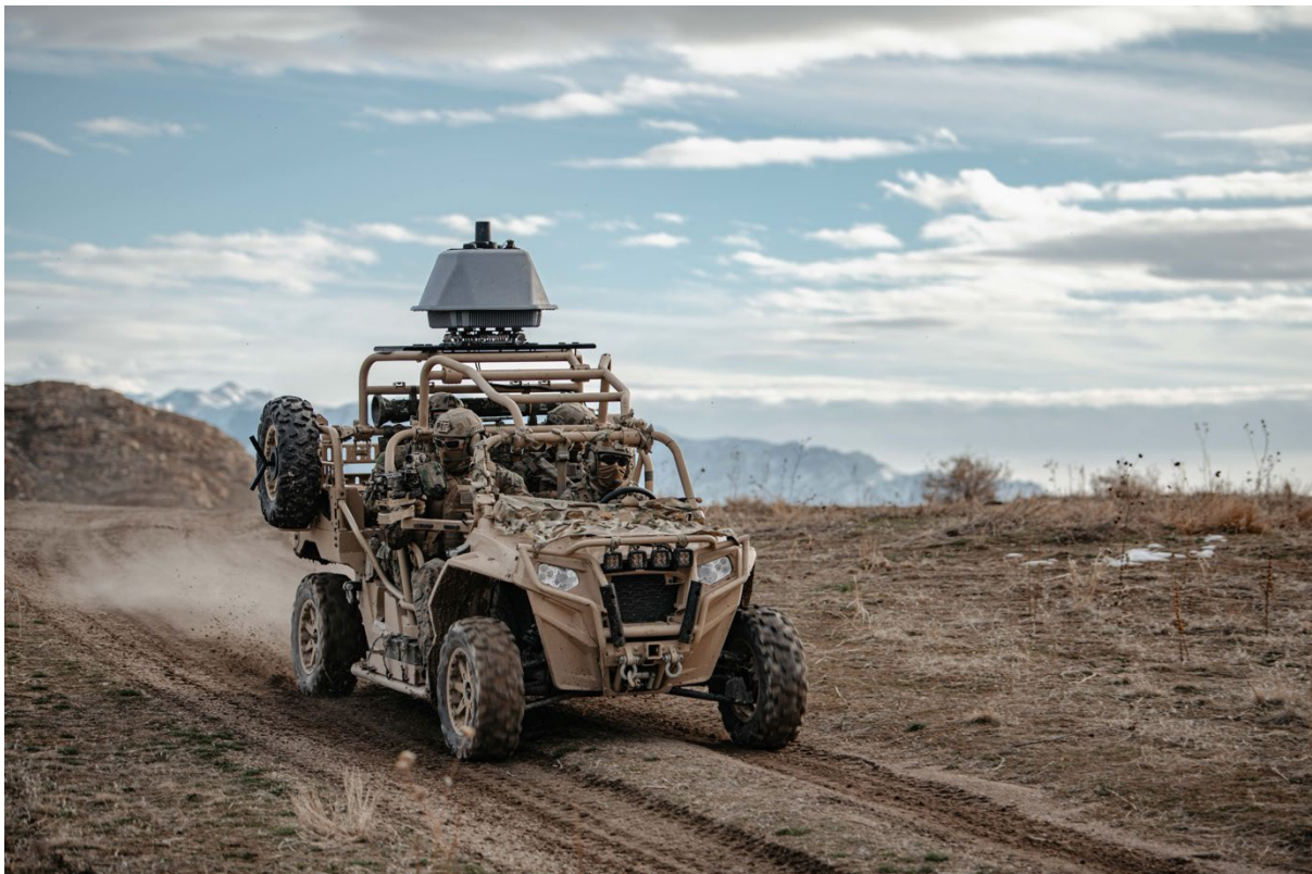
Image: DroneSentry-X Mk2, a wide-area multi-mission detection and defeat solution

DroneShield expects to deliver all equipment throughout Q4 2025 and Q1 2026, with cash payment expected in Q4 2025 and Q1 2026. No additional material conditions need to be satisfied. DroneShield has previously received 7 standalone orders from this reseller between March 2019 and July 2025, totalling approximately $2.9 million.