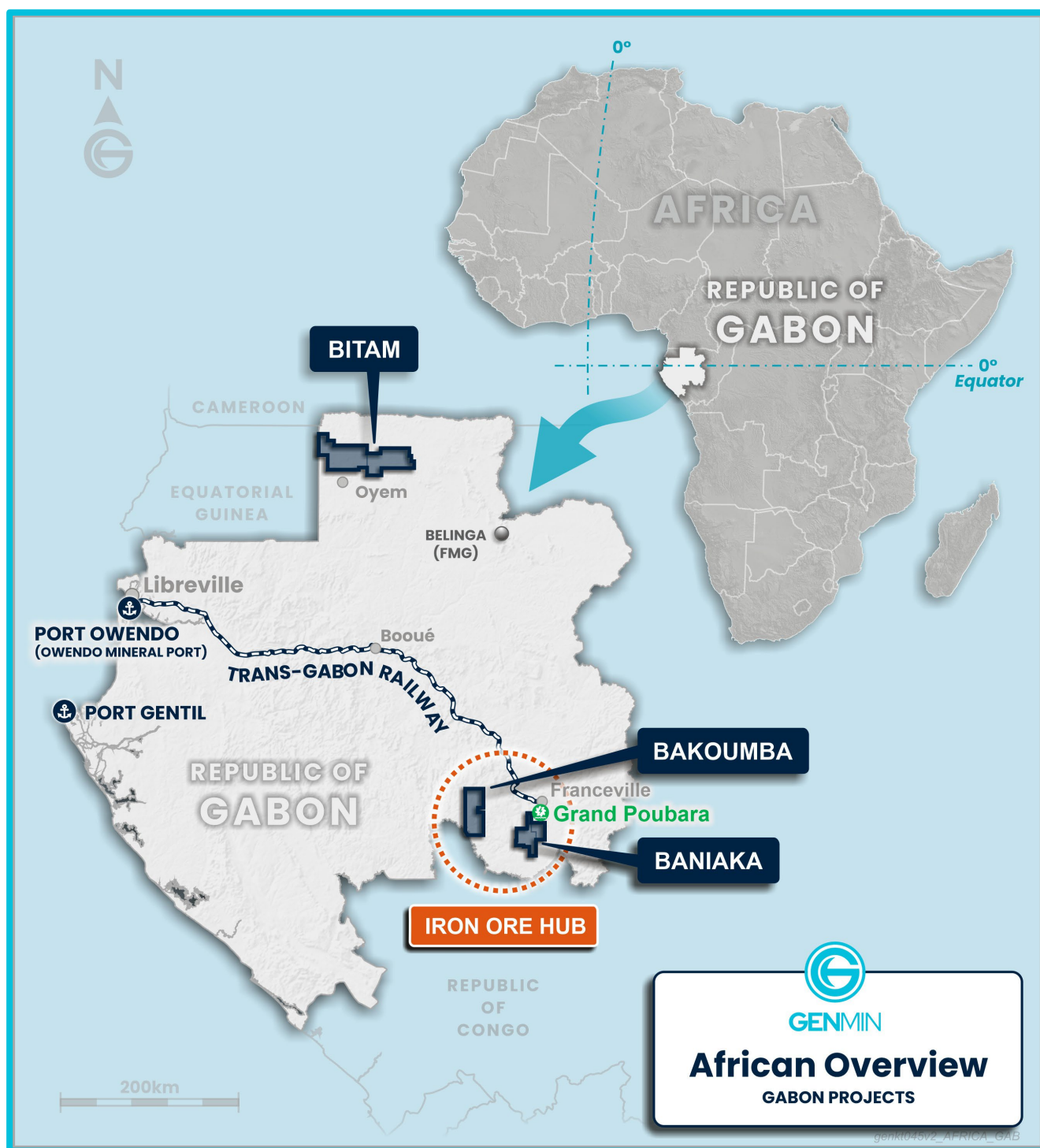
Figure 1: Location map of Genmin's projects in Gabon