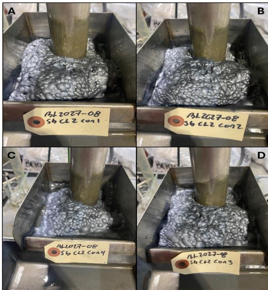
Figure 1; Photos of cleaner flotation test C08 for cleaning stage 1 (A), stage 2 (B), stage 3 (C) and stage 4 (D). Note silvery grey colour of the bubbles is due to stibnite collecting in

The updated metallurgical program has produced a concentrate grade far in excess of the minimum marketable grade of >55% Sb. Locksley's concentrate is approaching the theoretical maximum stibnite grade of 71.68% Sb.