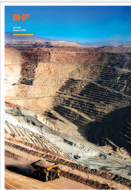
Annual Report 2025