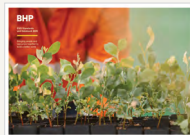
ESG Standards and Databook 2025