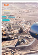
Modern Slavery Statement 2025