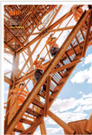
Economic Contribution Report 2025