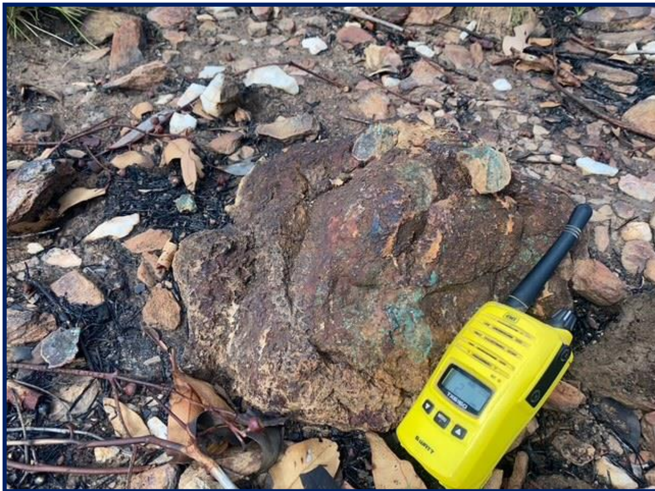
Photo 6: Blue Devil high grade copper gossans outcrop recently discovered BDR021; 52.3% Cu, 0.105 g/t Au & 5.5g/t Ag.

An on-country Heritage survey has now been completed at the Blue Devil EM target, a final report is expected over the coming weeks, following the approval of the Jaru Board. With a Heritage protection Agreement in place, the tenements are now pending government granting of tenure, a procedure now a formality process.