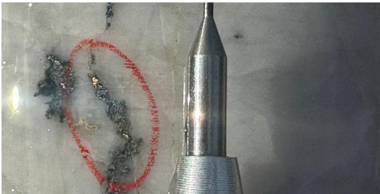
Figure 4. Diamond drill core from AMD009 at 201.6m metres down hole showing grains of visible gold (yellow) to 2mm hosted in an arsenopyrite vein (grey) in milky quartz. This occurs in a zone that graded 3.2m at 44.2g/t Au .