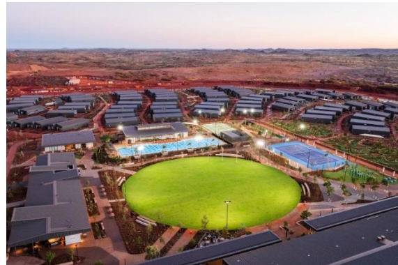
Mungala Resort at Ken's Bore completed