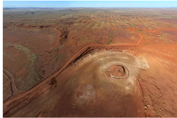
Cardo Bore East Pit