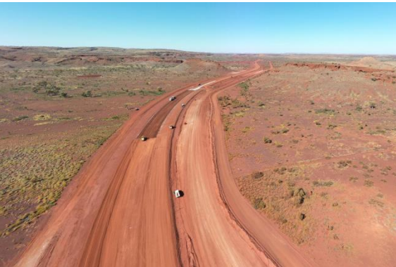
Upper Cane haul road construction