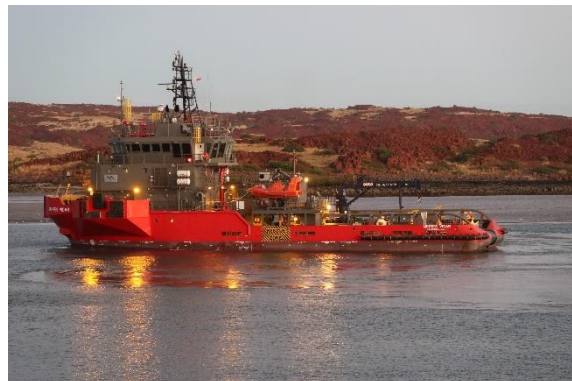
MinRes tug Vidar