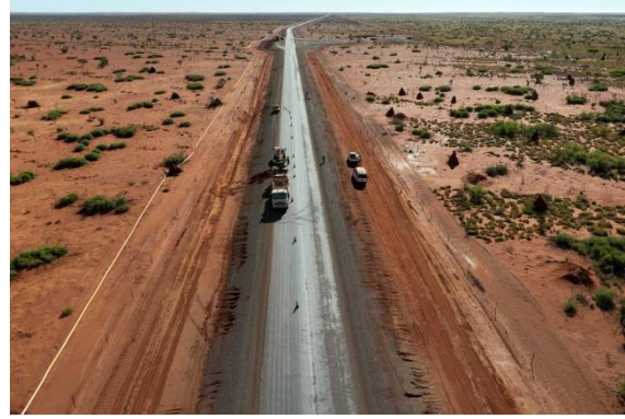
Private haul road upgrade in progress