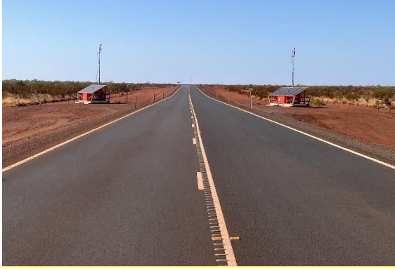
Upgraded section of private haul road