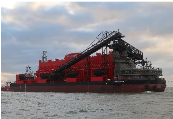
Fifth transhipper, MinRes Peak