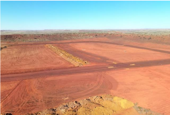
Upper Cane ROM