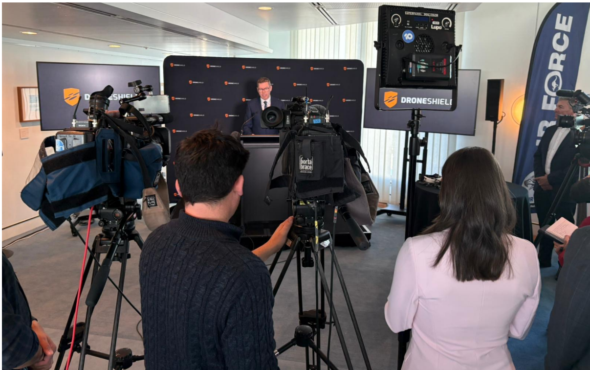
Image: Minister Conroy's LAND156 announcement

In addition to this equipment delivery, DroneShield stands ready to support the ADF as Systems Integration Partner under the broader LAND156 program. With deep expertise in sensor fusion, electronic warfare, and command-and-control integration, DroneShield is well positioned to contribute to the development of scalable, interoperable counter-drone architectures that meet Defence's evolving operational requirements.