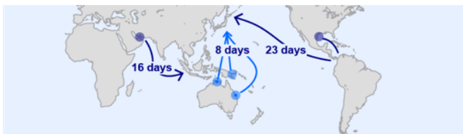
Santos LNG proximal to Asian demand centres 1