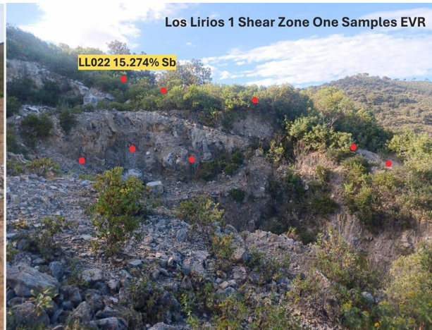
Historic Los Lirios 1 Open Pit