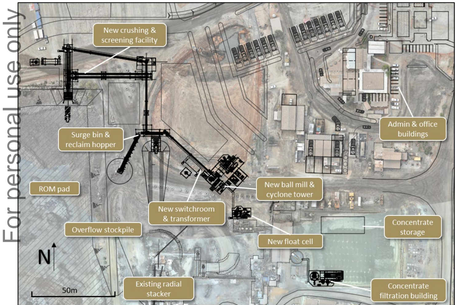
Figure 1. Plan showing layout of expanded Eloise processing plant

The expansion has been designed to minimise impact on current Eloise operations during construction (see Figure 1).