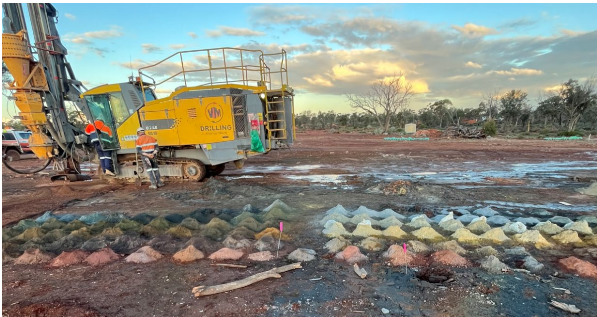
Figure 2: Grade Control RC Drilling Program well advanced at Lucky Strike.

The first phase of grade control drilling remains on target to be completed by the end of June (9200m drilled of a total 16,500m planned), with the Company particularly encouraged by the exceptional assay results received in early June (refer ASX release 3 June 2025).