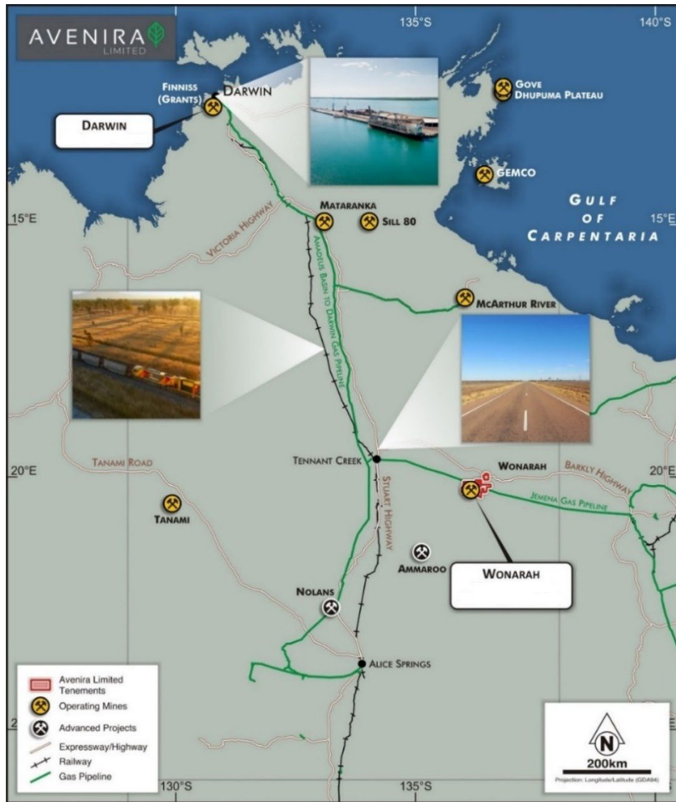
Figure 1: Location map of Wonarah