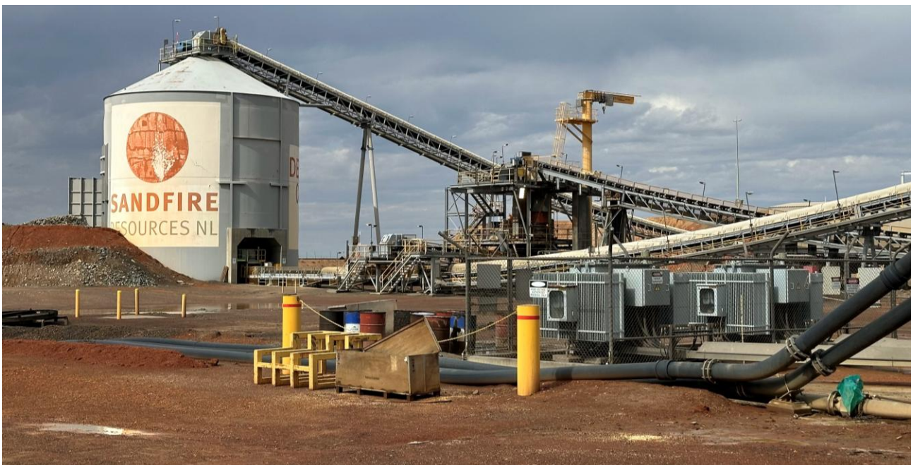
Figure 2: Image of the DeGrussa Processing Plant