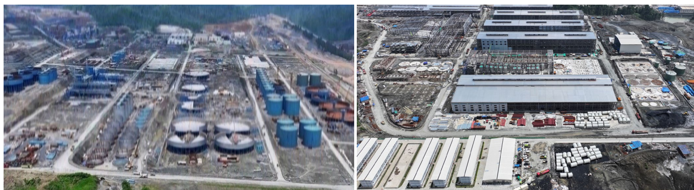
ENC HPAL (left) and sulfate and cathode refinery (right) construction progress

Subsequent to the end of the quarter, the Company has reached an agreement with its largest shareholder, Shanghai Decent, to defer the two remaining ENC acquisition payments of US$126.5m each by 6 months respectively to 1 January 2026 and 1 April 2026.