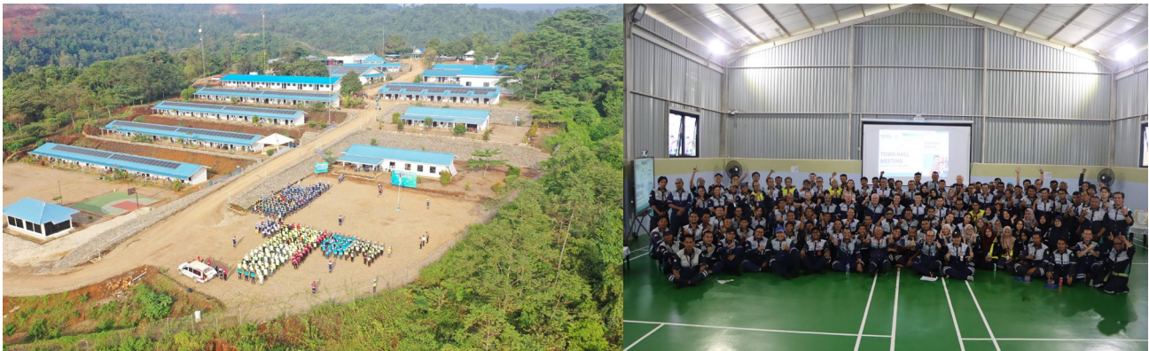
Hengjaya Mine camp

Project development remains ongoing, with an additional 4 tonnes of limonite bulk sample collected across the project area. The sample has been dispatched to the BRIN Mining Research Centre in Lampung, Indonesia, for metallurgical testing, including nickel leaching, acid consumption analysis, and further assessments on the recovery of scandium and other rare earth elements.