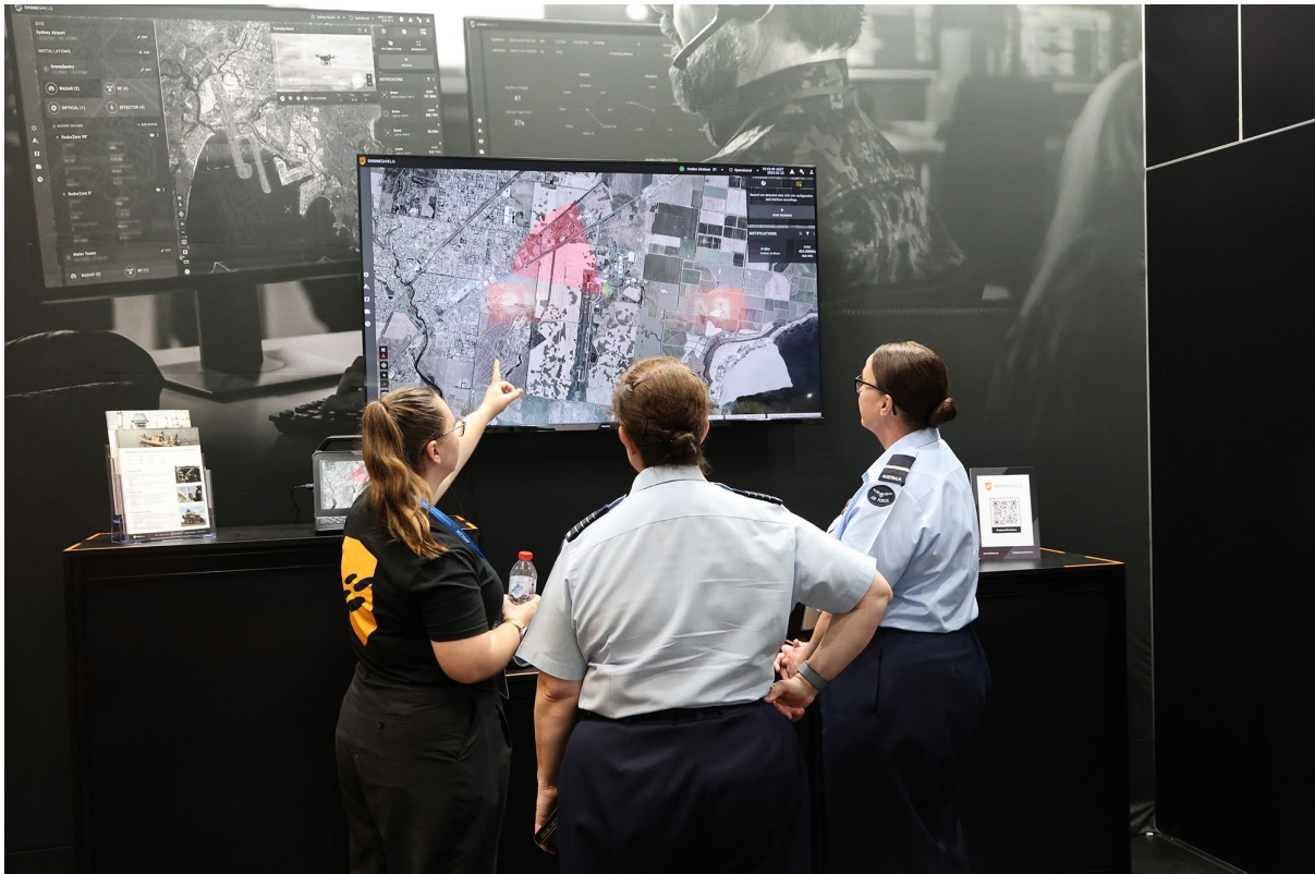
Image: DroneShield DroneSentry-C2 command and control system displayed at Avalon Airshow

DroneShield Limited (ASX:DRO) (DroneShield or the Company) is pleased to announce it has received a package of five separate contracts totalling $32.2 million from an in-country reseller for delivery to a military end customer in an Asian Pacific country. The reseller is a wholly-owned subsidiary of a multi-billion dollar, global, publicly listed customer that is contractually required to distribute the products to a major Asia Pacific military government department. The systems are for both vehicle-mounted and fixed Counter-UxS (counterdrone) systems. DroneShield expects to deliver all equipment and receive payment through Q2 and Q3 2025. No additional material conditions need to be satisfied.