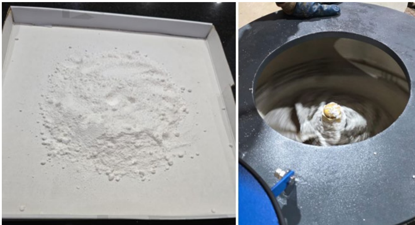
Figure 2 – 98.9% Lithium Carbonate (left) and processing in the plant's centrifuge (right)