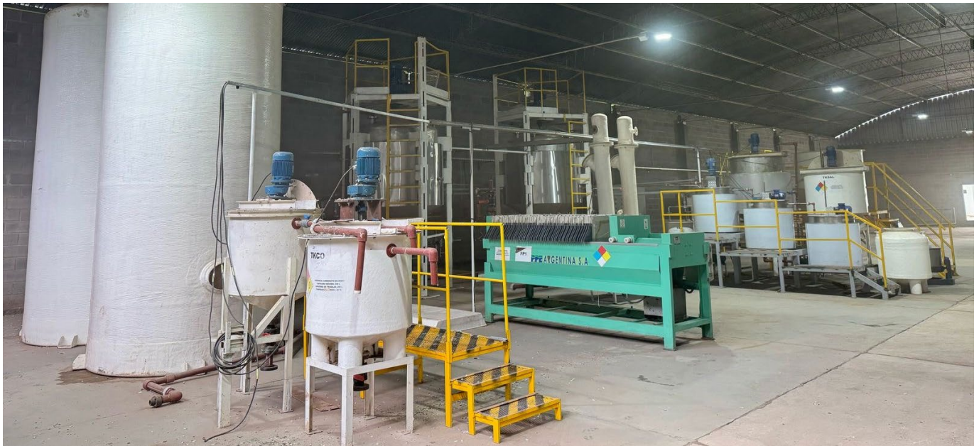
Figure 3 – 250tpa Lithium Carbonate Pilot Plant Ready for Production.

Building on the success of first production and recent plant upgrades, Pursuit is now advancing key permitting activities to support the relocation of its 250tpa Pilot Plant to the Rio Grande Sur site. In parallel, the Company is progressing submissions under its existing environmental permits to enable the construction of small-scale evaporation test ponds at the Maria Magdalena tenement. These ponds will facilitate the small-scale, low-cost pumping of brine from the cased DDH-1 well, allowing for on-site evaporation and processing through the pilot plant, further validating end-to-end production under real-world conditions.