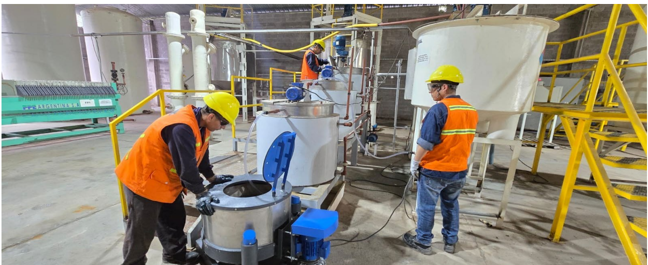
Figure 1 – Pursuit’s 250tpa Pilot Plant producing Lithium Carbonate in Salta, Argentina.

“This is an outstanding milestone for Pursuit and a defining moment in the evolution of our Rio Grande Sur Project. Successfully producing high-purity lithium carbonate places us among a very select group of ASX-listed companies to have achieved this level of technical and operational execution. It is a clear validation of our flowsheet, our team, and our strategy to deliver scalable, cost-effective lithium production. With this achievement, we’ve taken a major step forward in unlocking long-term value and positioning Pursuit as a serious contender in the global lithium supply chain.”