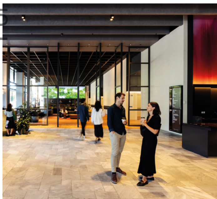
2 Southbank Boulevard, Melbourne