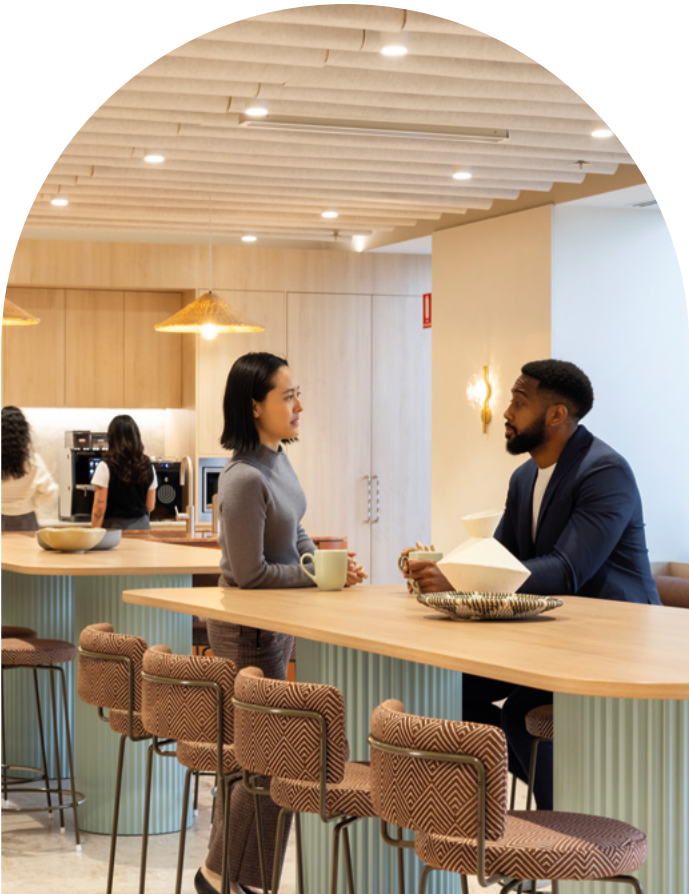
GPT Space&Co, Darling Park, Sydney