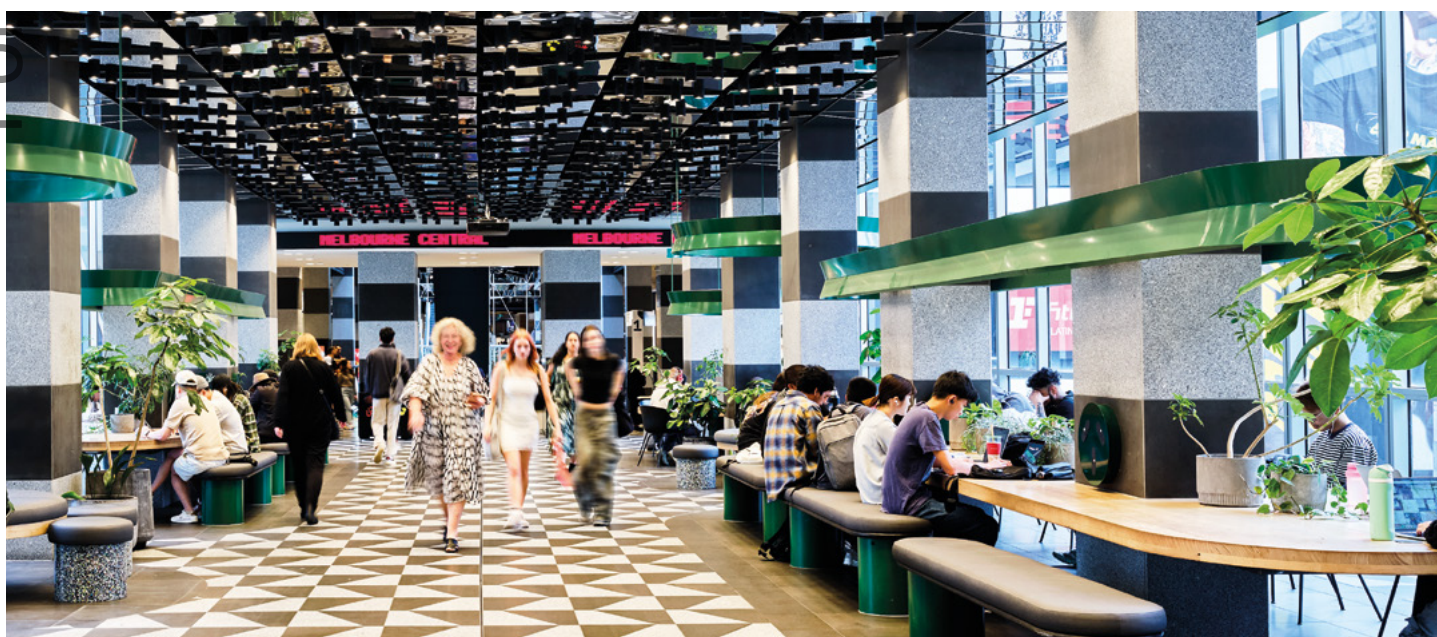
Melbourne Central, Melbourne

Securityholders may also submit written questions to the Auditor relevant to the content of the audit report for the Company or the conduct of the audit for the Company using the methods listed on page 07 under the heading 'Submitting written questions in advance of the Meeting'. A list of those relevant written questions submitted to the Auditor will be made available to Securityholders who attend the Meeting. The Auditor will either answer the questions at the Meeting or table written answers to them at the Meeting. If written answers are tabled at the Meeting, they will be made available to Securityholders as soon as practicable after the Meeting.