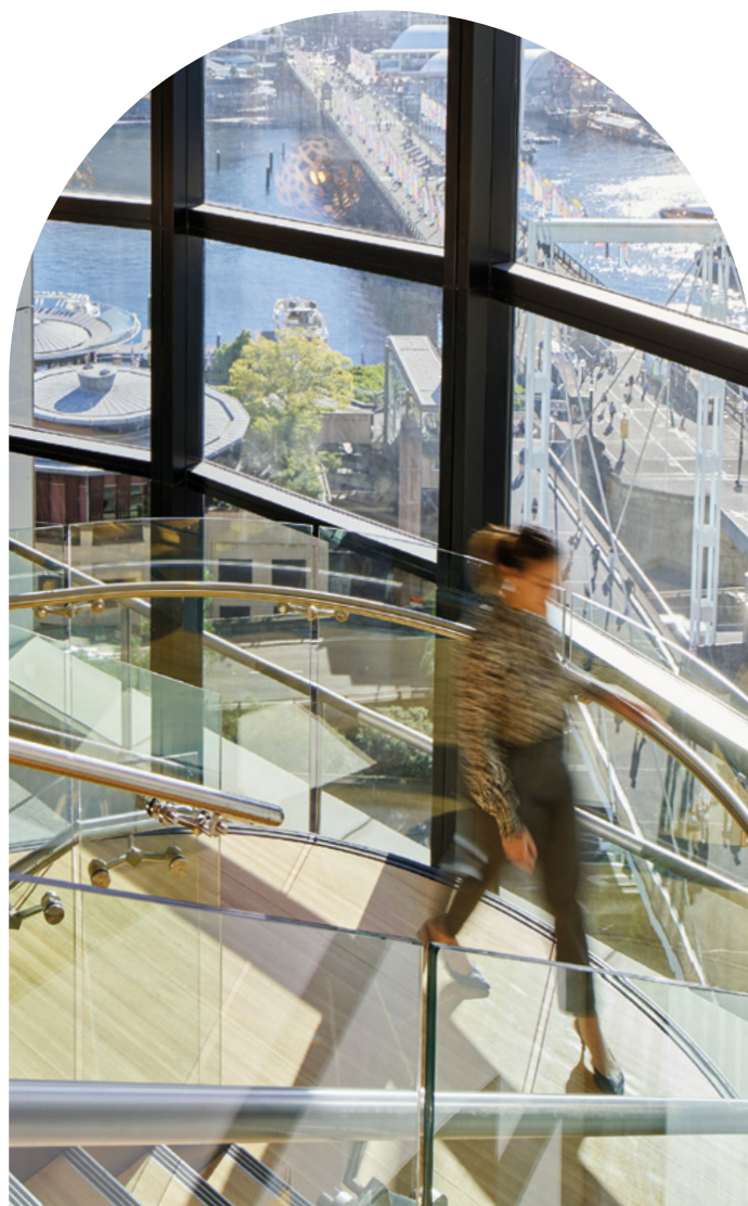
Darling Park, Sydney

Securityholders may appoint proxies (including the Chairman of the Meeting) to cast their votes on their behalf at the AGM. More information on appointing proxies is available on page 06.