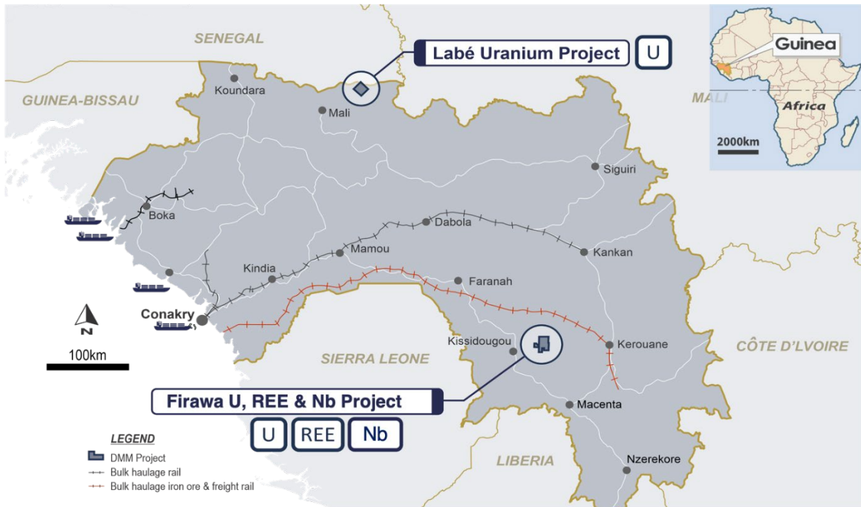
Figure 2 - Project Location Map