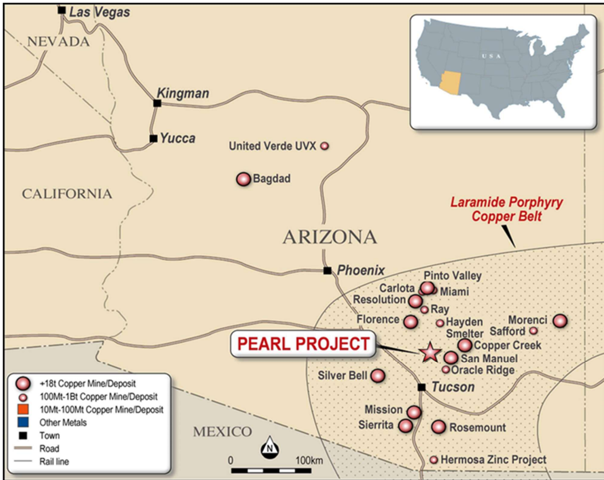
Figure 1: Location of Pearl and Significant Copper Mines and Projects in Arizona USA

The Project is adjacent to the world-class San Manuel-Kalamazoo Mine, with historic production of approximately 1Bt @ 0.7% Cu. Many other deposits occur in the greater area around the Project, with Arizona being host to some of the world’s largest copper discoveries.