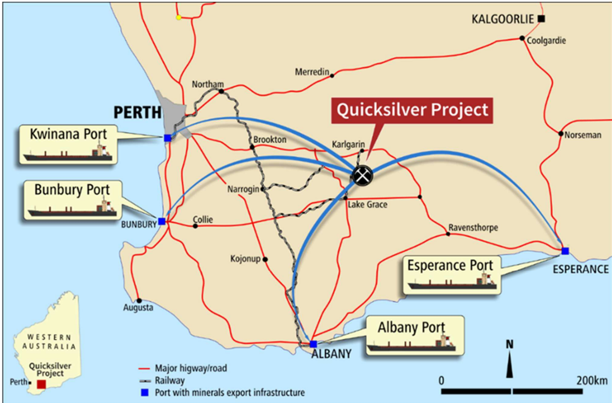
Figure 3: Location of Quicksilver Nickel-Cobalt Project.

The Quicksilver Project, located near the town of Lake Grace, is approximately 300km south-east of Perth, Western Australia. Centred over a narrow greenstone belt, the Project is prospective for nickel-cobalt, and gold. The Project is host to significant nickel-cobalt mineralisation overlying a series of sheet flow facies komatiite units. Drilling by the Company in 2017-2018 resulted in a maiden indicated and inferred Mineral Resource Estimate of 26.3Mt at 0.64% Ni and 0.04% Co for 168,500 tonnes of contained nickel, and 11,300 tonnes of contained cobalt 1 .