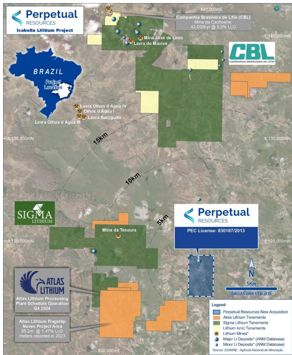
Figure 1 – Regional map of Isabella Project area adjacent to Atlas Lithium and Sigma 1,2,3 .

During the half-year period Perpetual acquired the Isabella Lithium Project in Brazil's Lithium Valley and made significant progress in its exploration and evaluation.