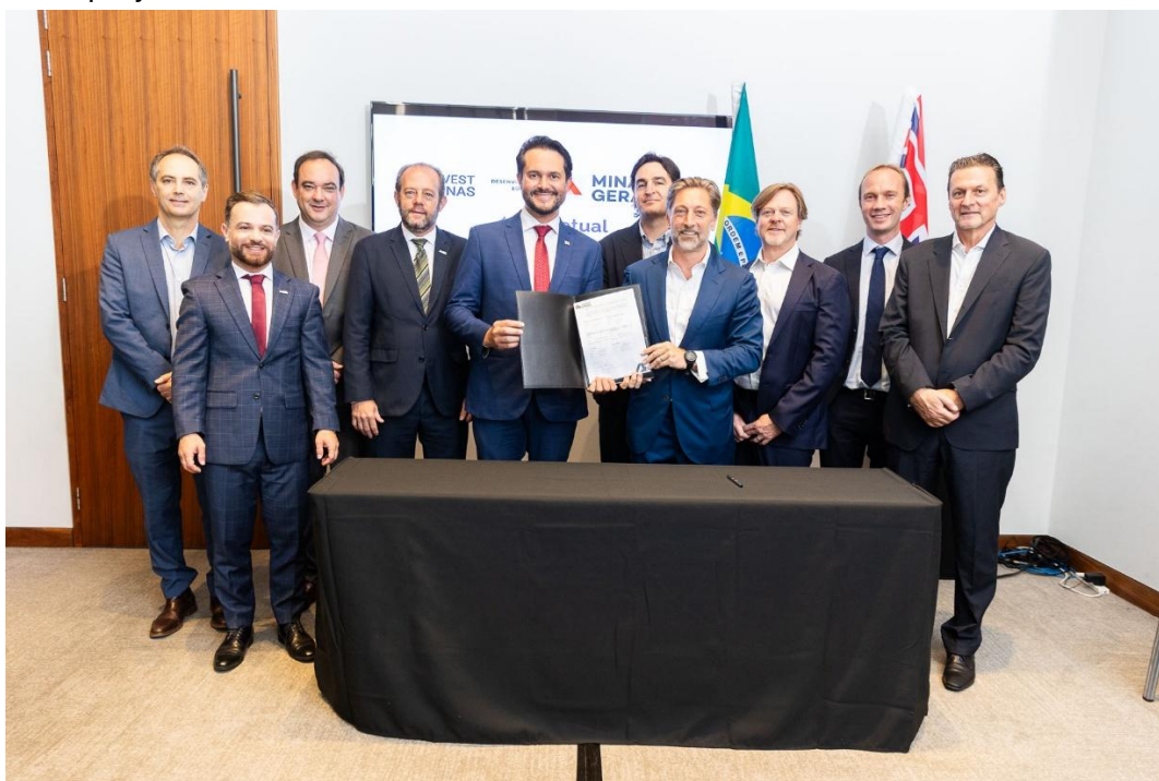
Figure 3 – Representatives of Perpetual with representatives of State for Economic Development of Minas Gerais and Invest Minas post formal signing of MOU in Sydney on 30 October 2024.

Perpetual has strengthened its strategic position by signing a Memorandum of Understanding (MOU) with the Government of Minas Gerais and Invest Minas. This agreement is designed to facilitate project development and streamline regulatory approvals, ensuring a more efficient pathway for the Company's exploration and operational activities. Through this partnership, Perpetual gains government-backed support for critical licensing, environmental approvals, and exploration permits, significantly reducing approval timelines and enhancing the overall feasibility of its projects.