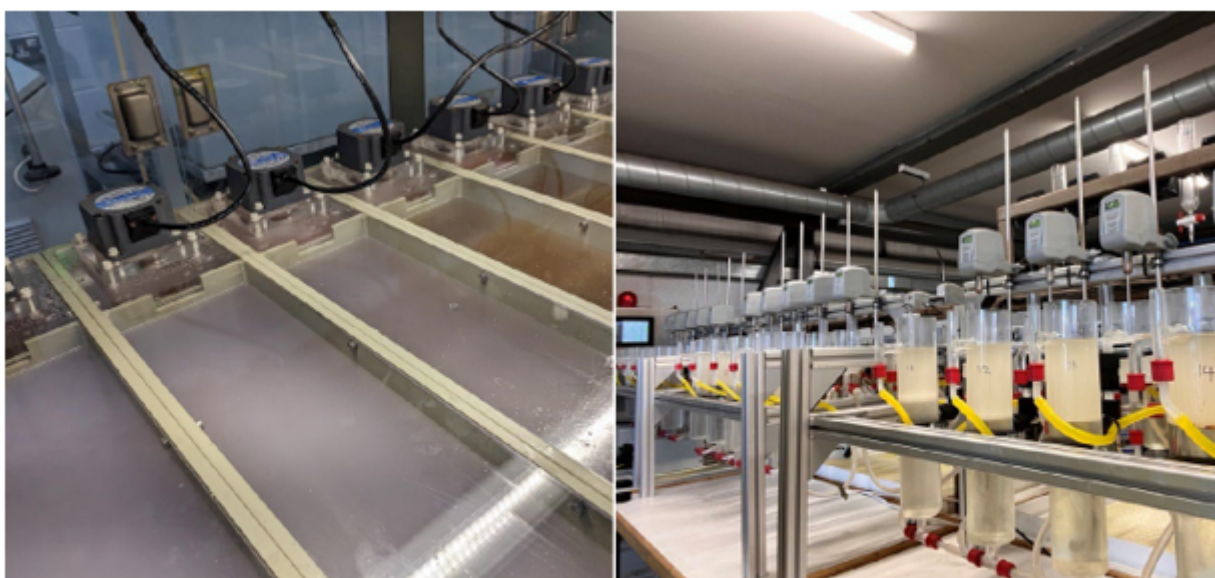
Figure 2: Ionic Technologies' demonstration scale solvent extraction (SX) circuit (left), and Ionic Technologies' Heavy REE SX circuit (right).