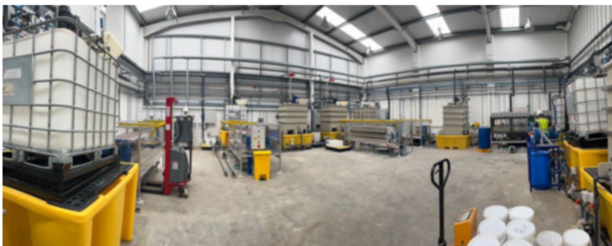
Figure 1: Ionic Technologies' Demonstration Plant (Belfast, UK).