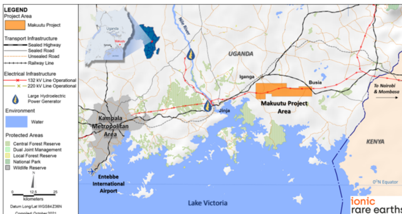
Figure 3: Makuutu Rare Earths Project Location with major existing nearby infrastructure.

Makuutu comprises nine licences (see Figure 3) covering approximately 300 square kilometres, located 120 kilometres east of Kampala in Uganda. The deposit, stretching 37 km end to end, is situated near existing infrastructure and has the potential to provide western customers with a strategic alternative supply of heavy rare earths to support the development of resilient supply chains, and the growth of advanced manufacturing and industries critical to achieve net-zero carbon initiatives for 50 years and beyond.