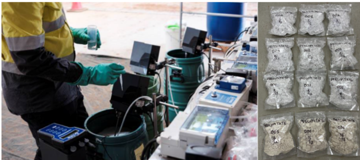
Figure 4: Demonstration plant precipitation circuit and inventory of MREC samples dispatched to Australia for analysis.

Due to market conditions, works was slowed during the half in an effort to preserve funding.