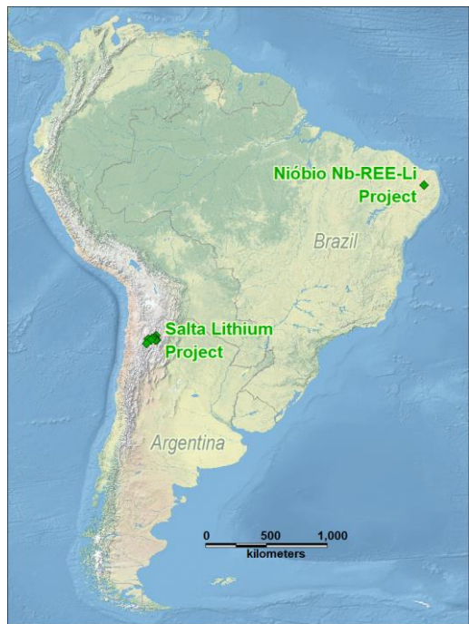
Figure 1: Map of South American Projects

Having executed bespoke, project-specific development strategies for three core assets (Rincon, Incahuasi, and Pular) at its Salta Lithium Project, Power's exploration efforts during the period focused on the Nióbio Project, where it advanced to a maiden drill program in December 2024.