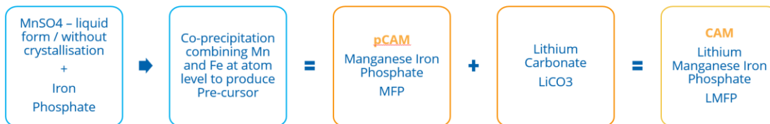
Image 2: High level process flowsheet for Firebird Co-precipitation process

Through the execution of this strategy, Firebird aims to secure a natural cost advantage in LMFP cathode production, particularly by integrating manganese sulphate ( MnSO_4 ) from its proposed production plant in China.