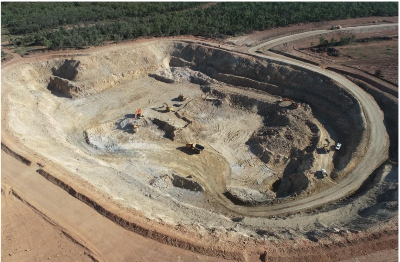
Figure 3: Pearse North open pit mining operations by January 2025 (facing north east).