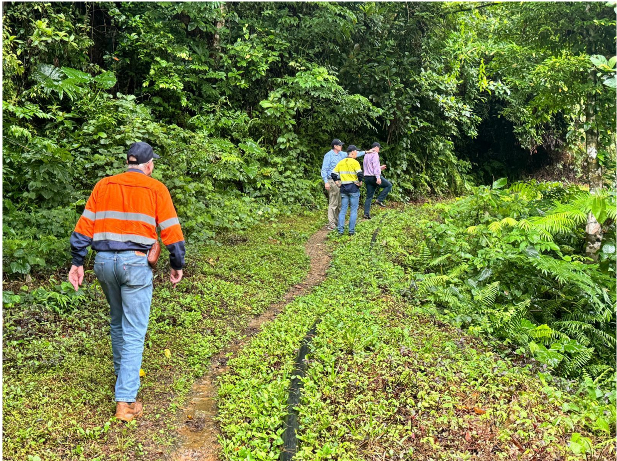
Figure 6: Argonaut site visit conducting due diligence work.

Kingston continued to advance the Misima Gold Project during the half, progressing landholder identification studies and ongoing environmental monitoring in support of the Environmental and Social Impact Assessment (ESIA). The company remains deeply engaged with the local community, implementing initiatives aimed at empowering locals in education, health, and business development. Notably, Kingston facilitated a Women in Business program, reaching over 629 women since its inception in 2023, with a focus on empowering women through business training and financial literacy programs.