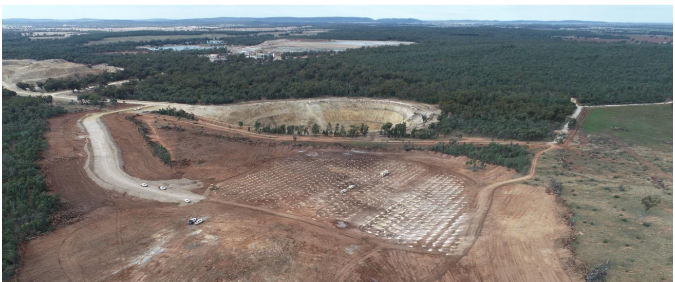
Figure 1: Pearse North pit prior to the initial blast (facing south).

Kingston rapidly increased crushing and grinding rates to be running consistently at 50 tonnes per hour, 20% above the original plant design. Weekly gold and silver sales were established as early as September 2024.