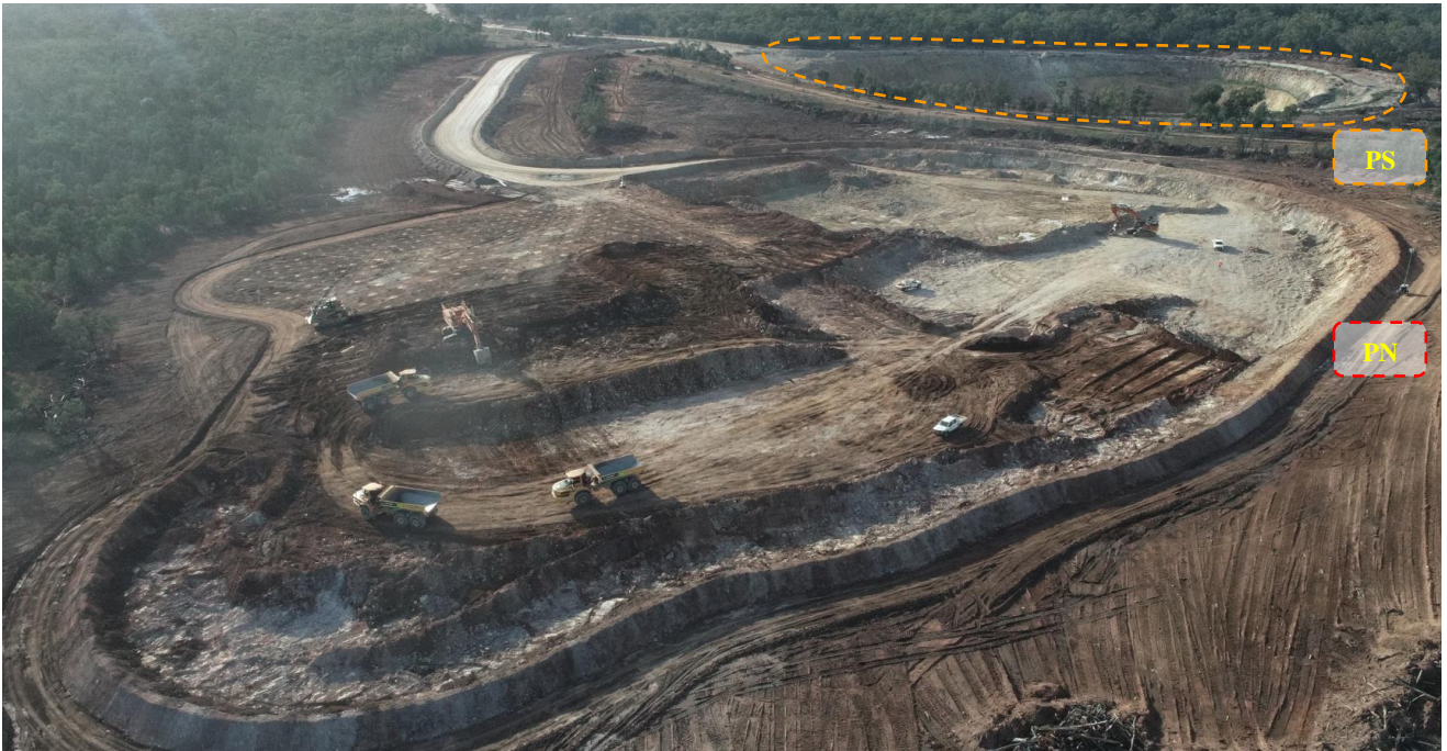
Figure 2: Pearse North (PN) open pit in July 2024. Pearse South (PS) pit in the background (facing south).